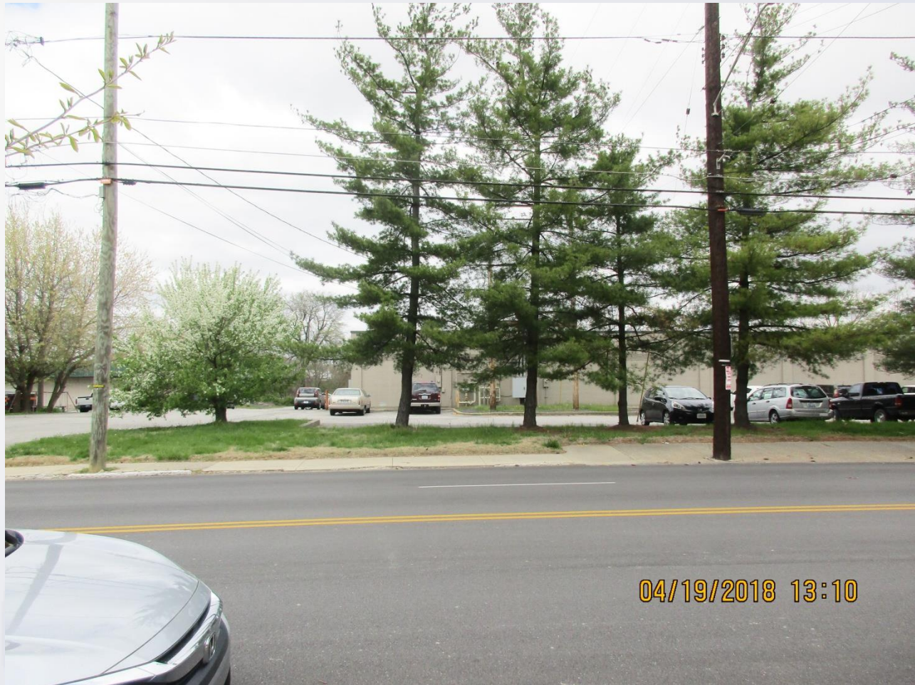
Adjacent to North