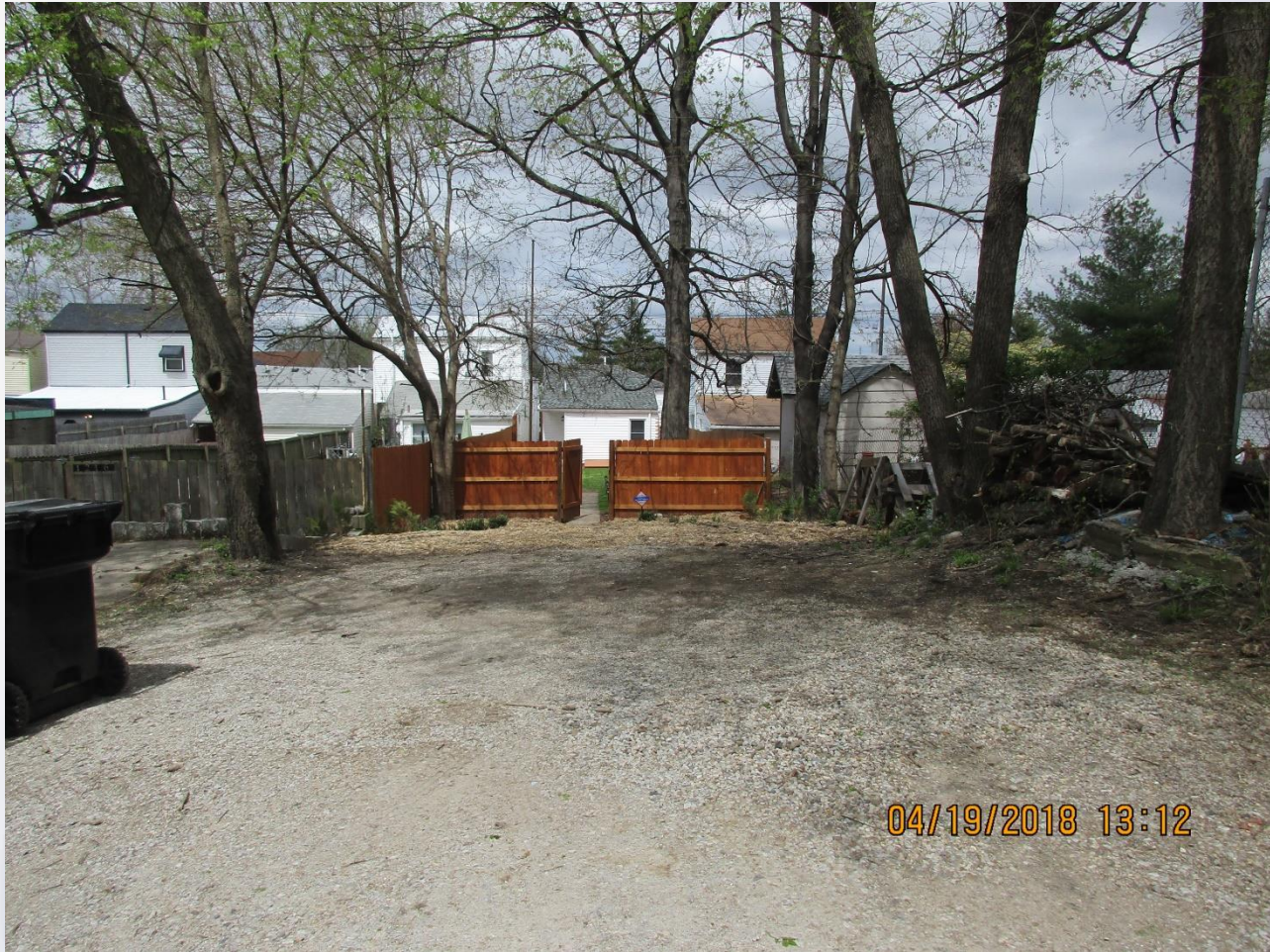
Parking at Rear