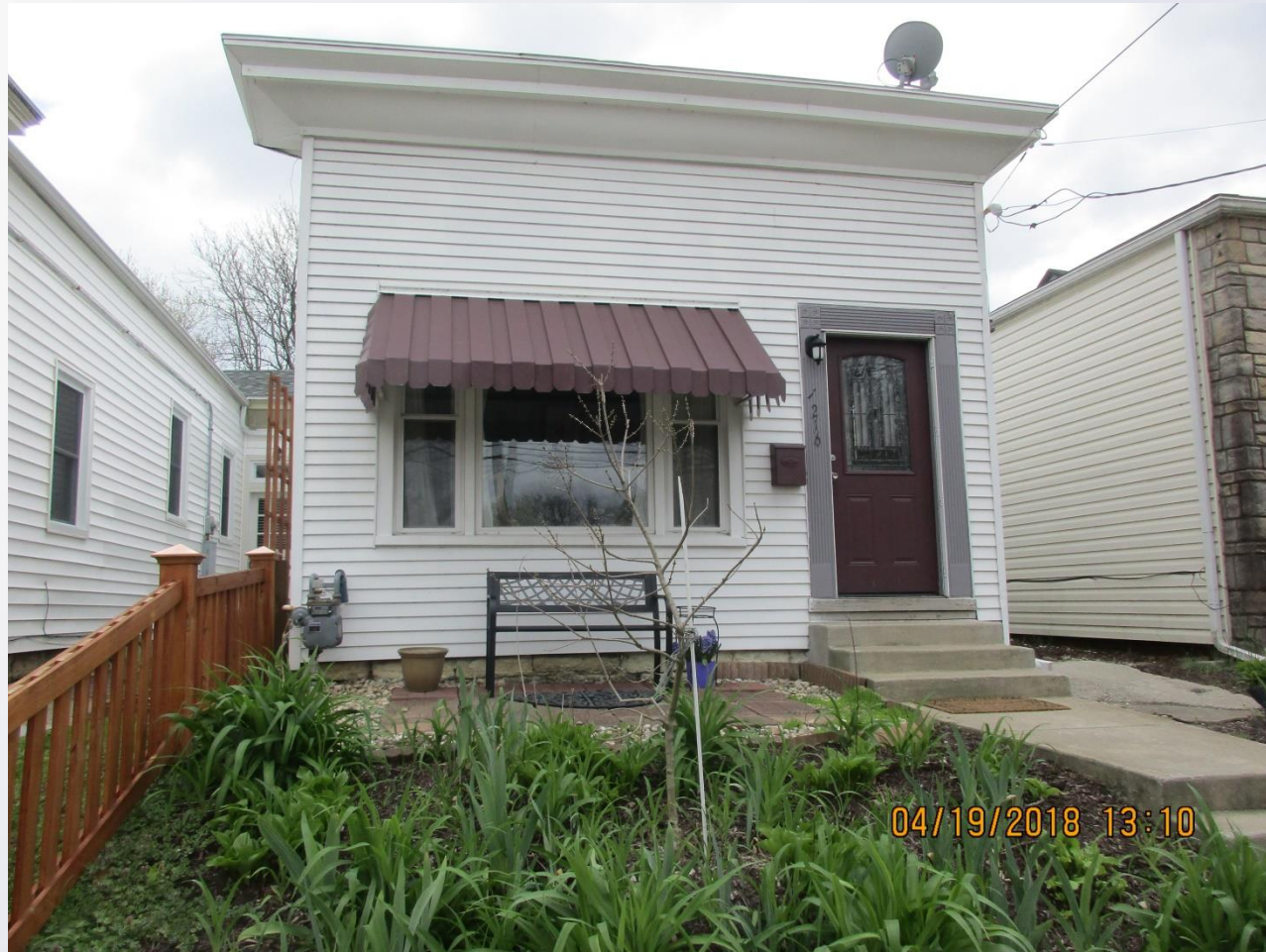
Adjacent to West