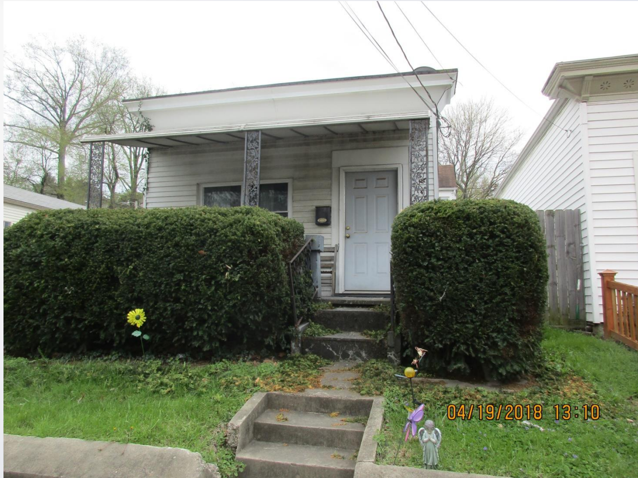
Adjacent to East