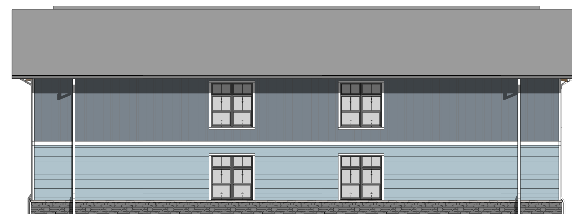
4 Schematic Elevation- Type A - Left SD2.101 1/8" = 1'-0"