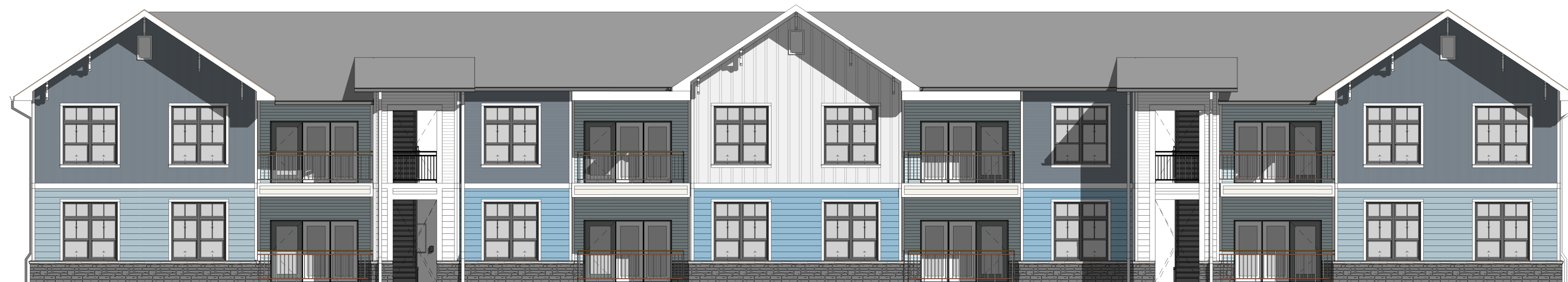
2 Schematic Elevation- Type A - Front SD2.101 1/8" = 1'-0"