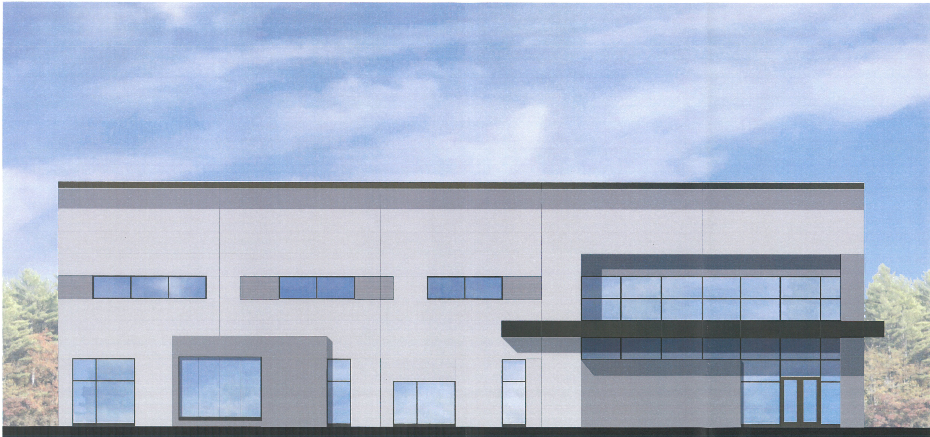
LOT 11 - FRONT ELEVATION