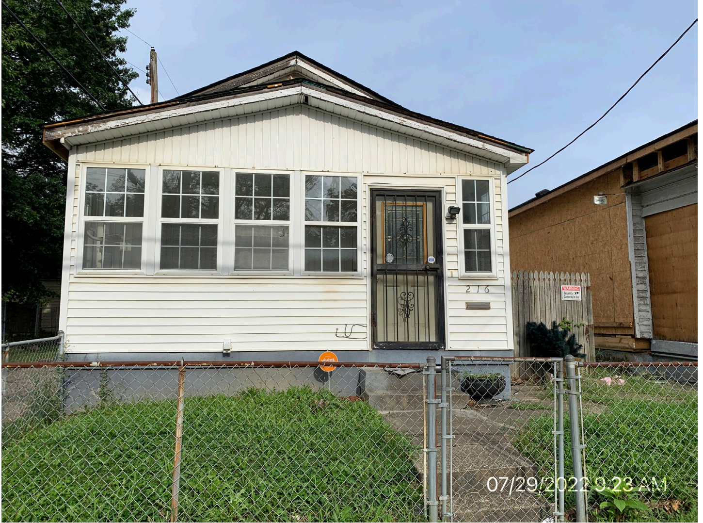
Left of subject property.