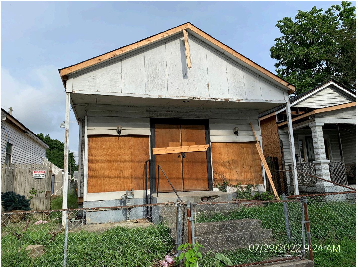
Front of subject property.