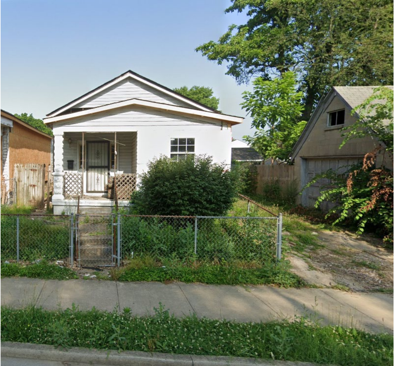
Right of subject property, Google 2022.