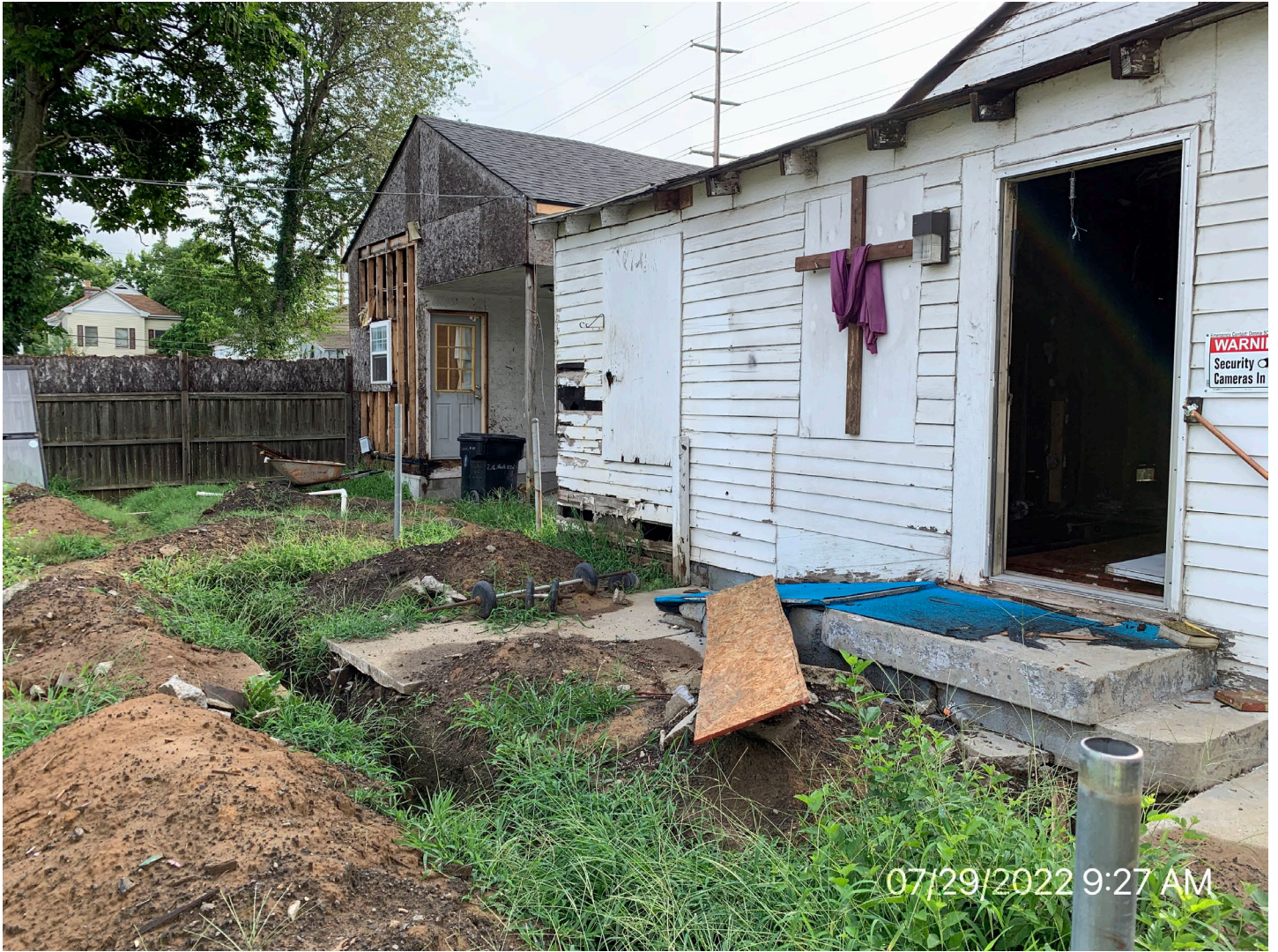
Rear yard and variance area.