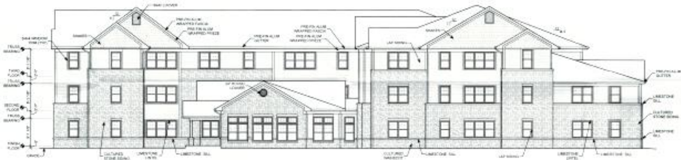
RIGHT SIDE ELEVATION SCALE 1/8" = 1'-0"