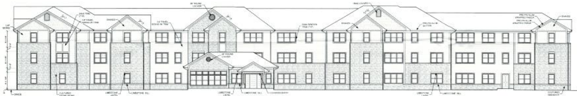
FRONT ELEVATION TOWARD S. HURSTBOURNE PKWY SCALE 1/8" = 1'-0"