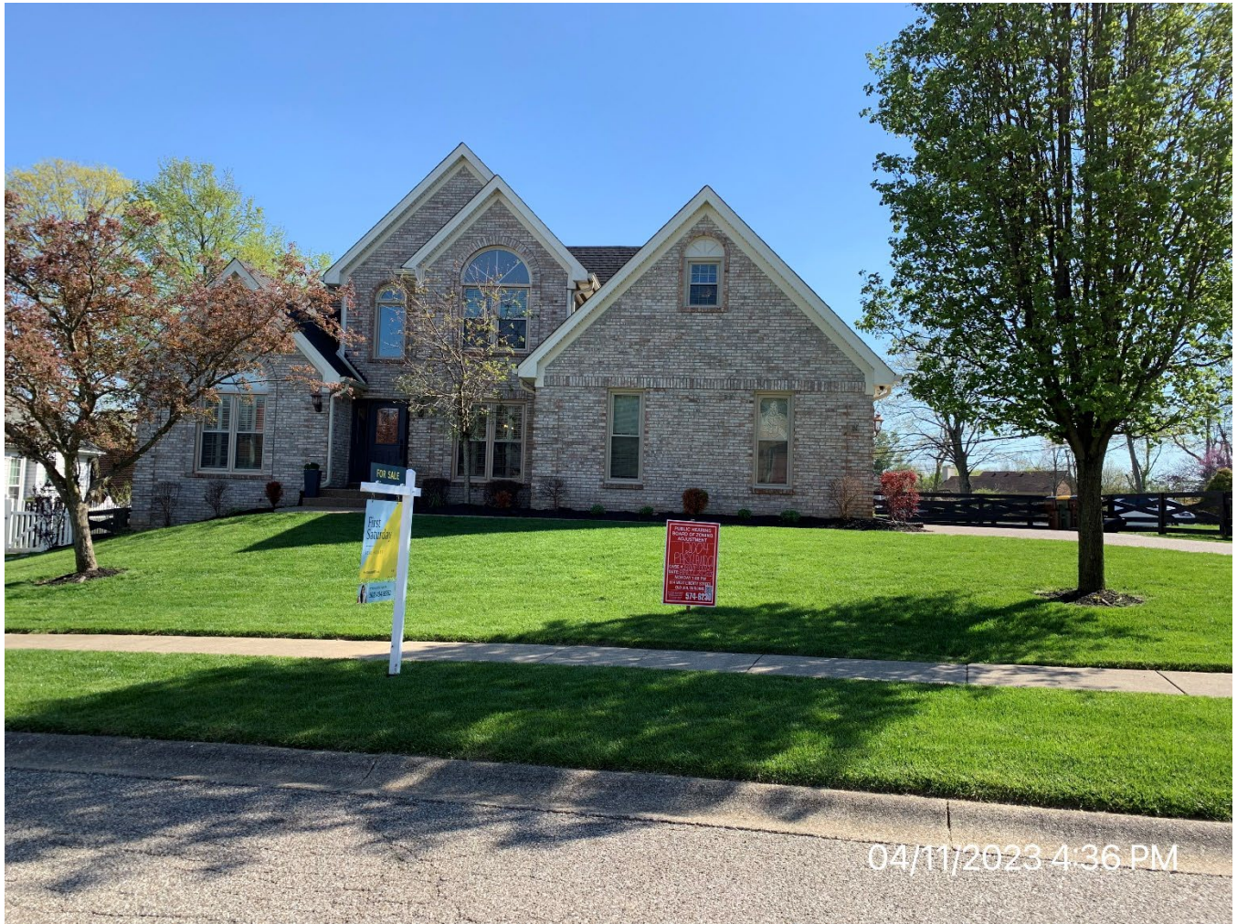
Front of subject property.