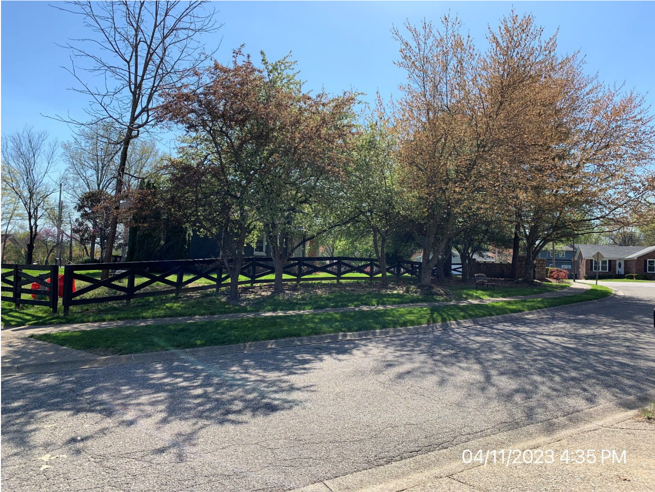
Property to the right.