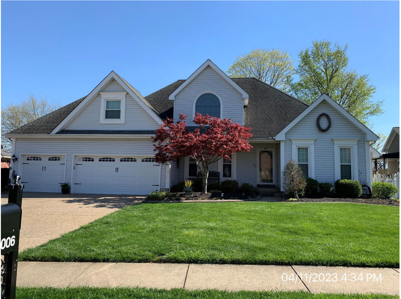
Property to the left.