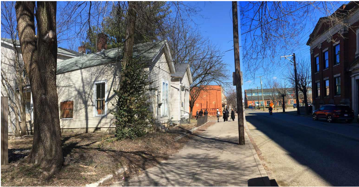
18 th Street Today