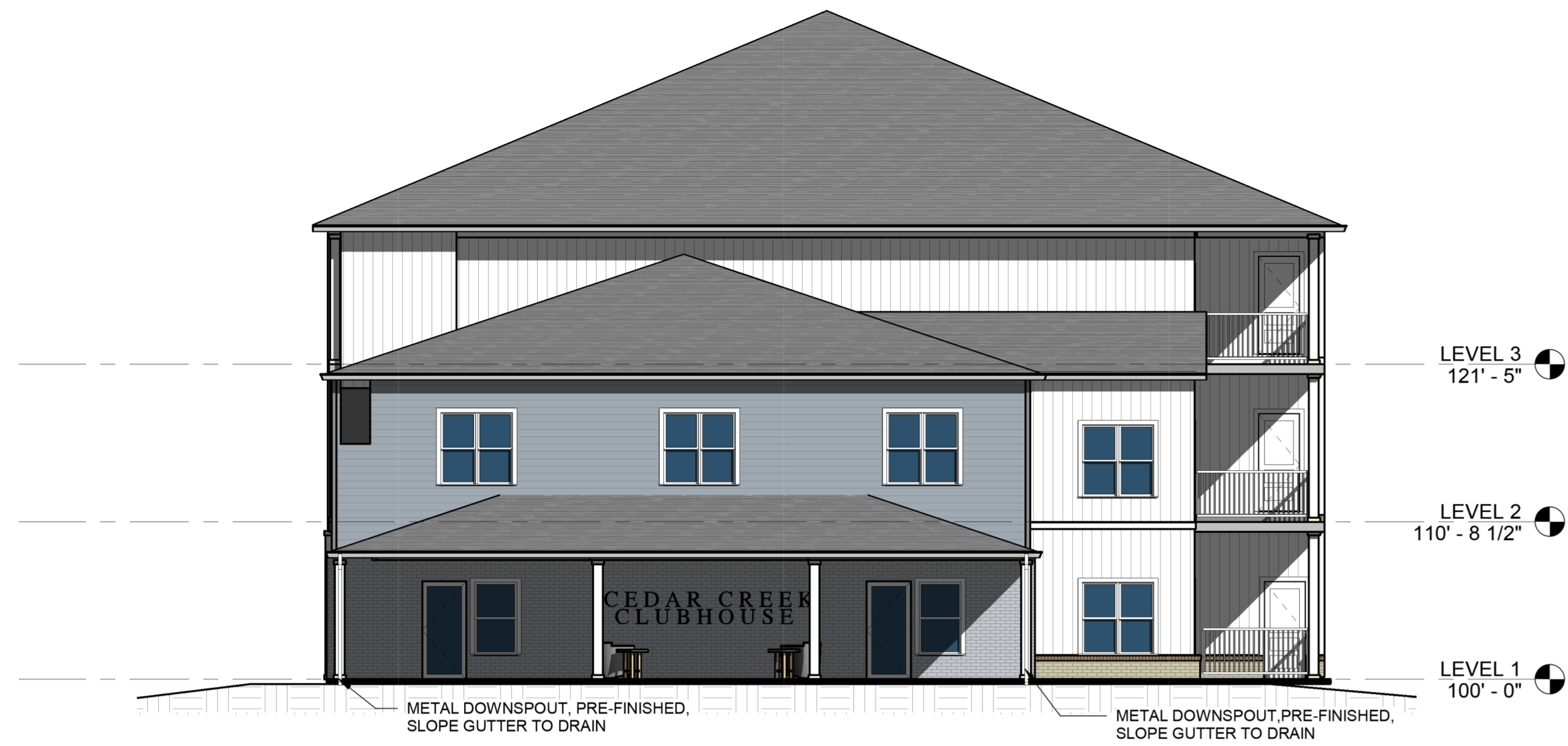
3 BUILDING ELEVATION 1/8" = 1'-0"