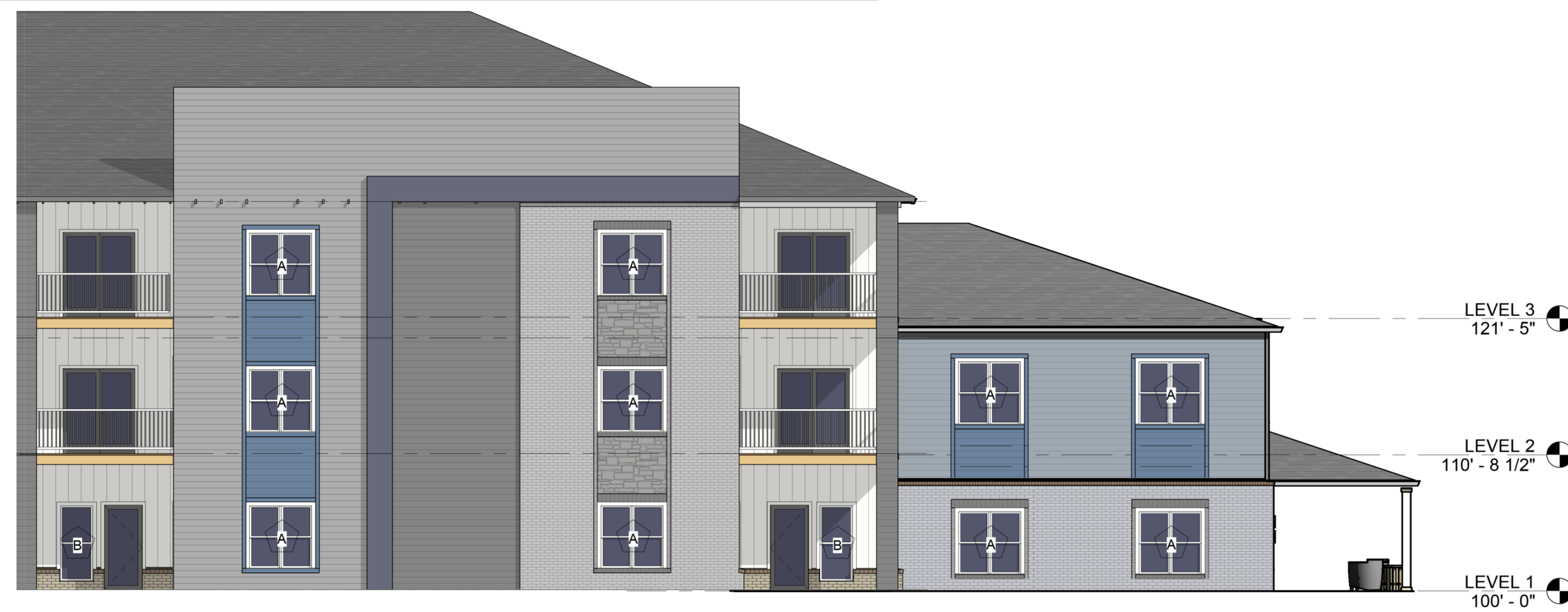
2 CLUBHOUSE ELEVATION SIDE 2 1/8" = 1'-0"