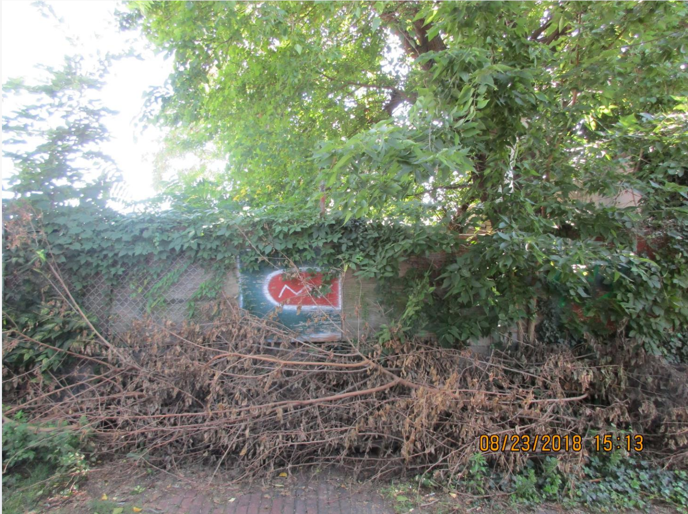
Rear Yard to Alley Wall