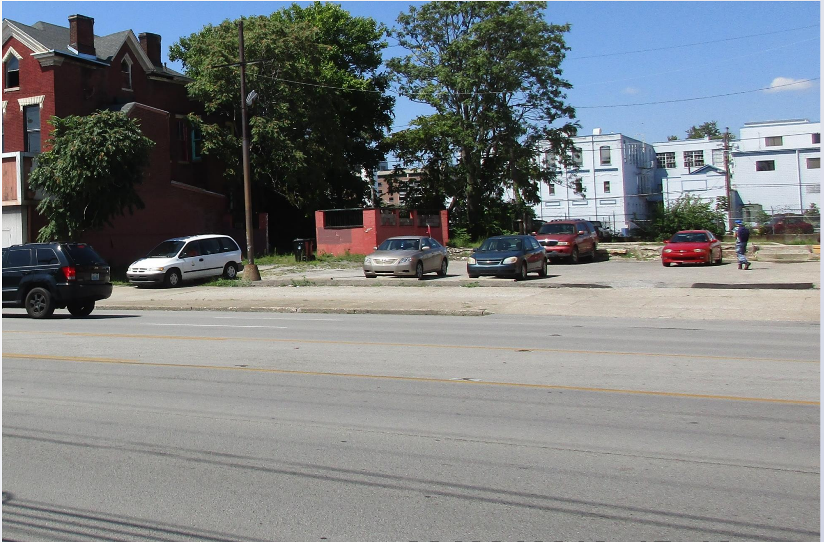
Adjacent to West