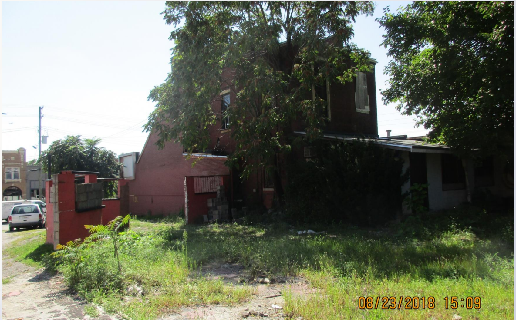
Rear Yard West to East