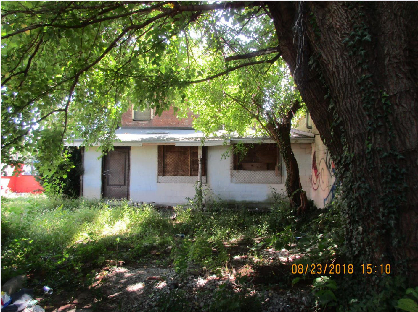
Rear of Structure