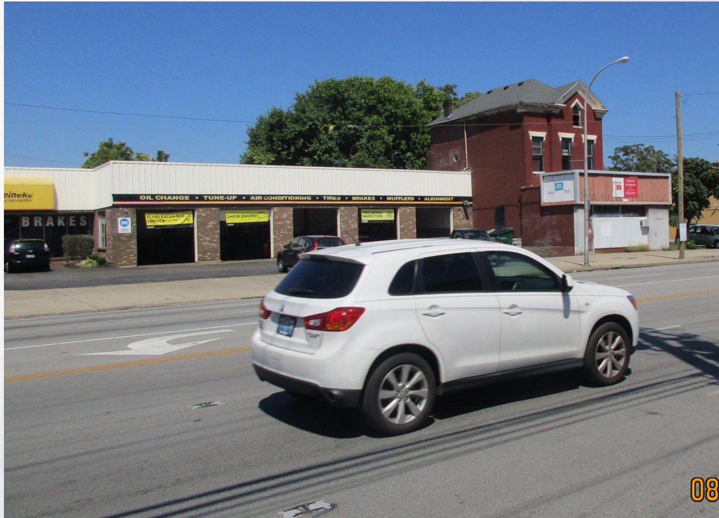
Adjacent to East