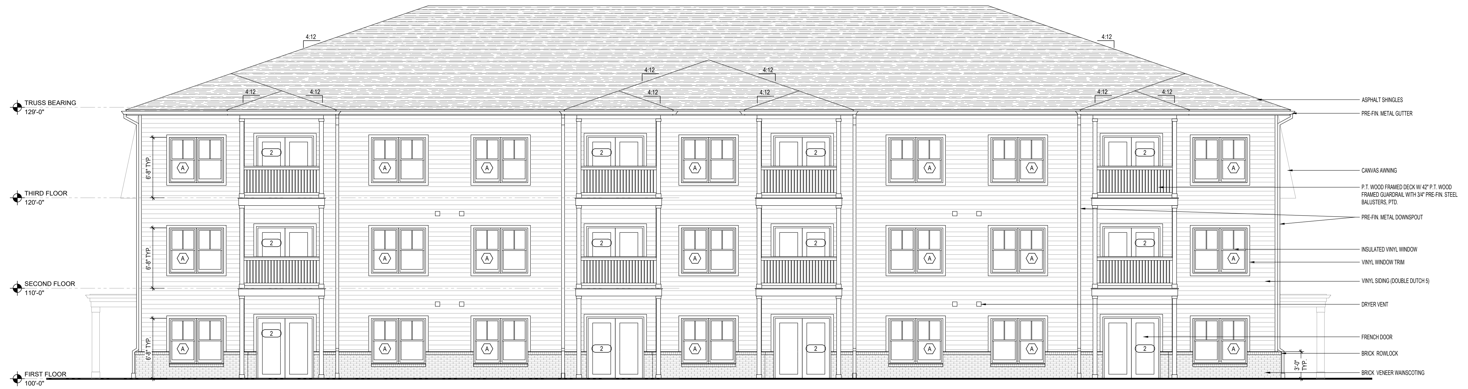
01 FRONT & REAR ELEVATIONS (MIRRORED) Scale: 3/16" = 1'-0"