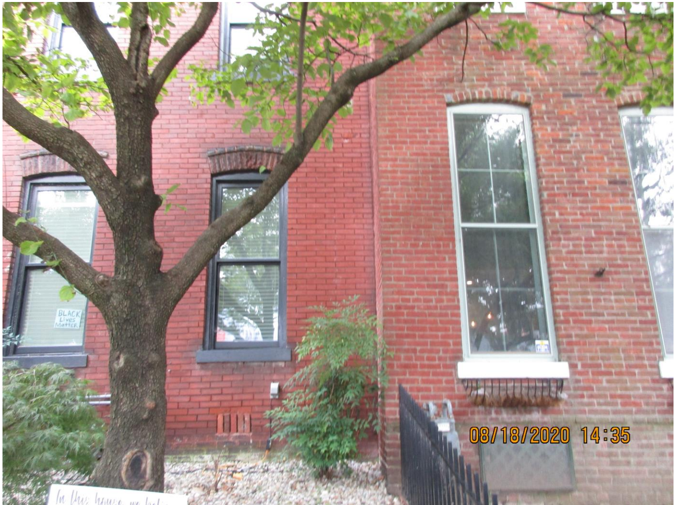
Subject property and property to the left.