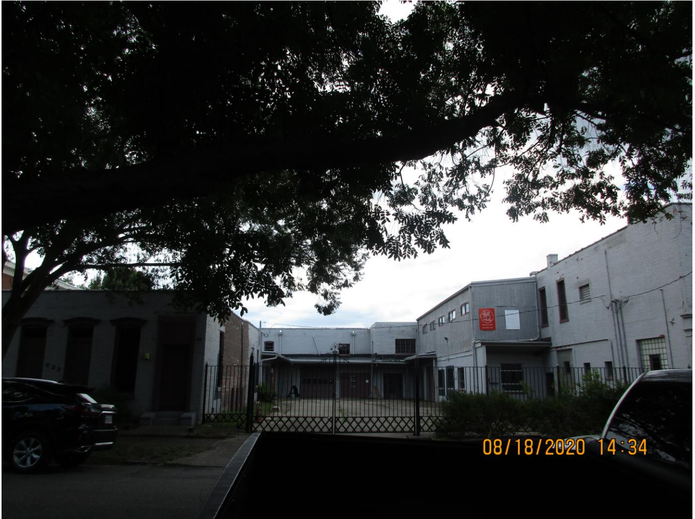
Property across Franklin Street.