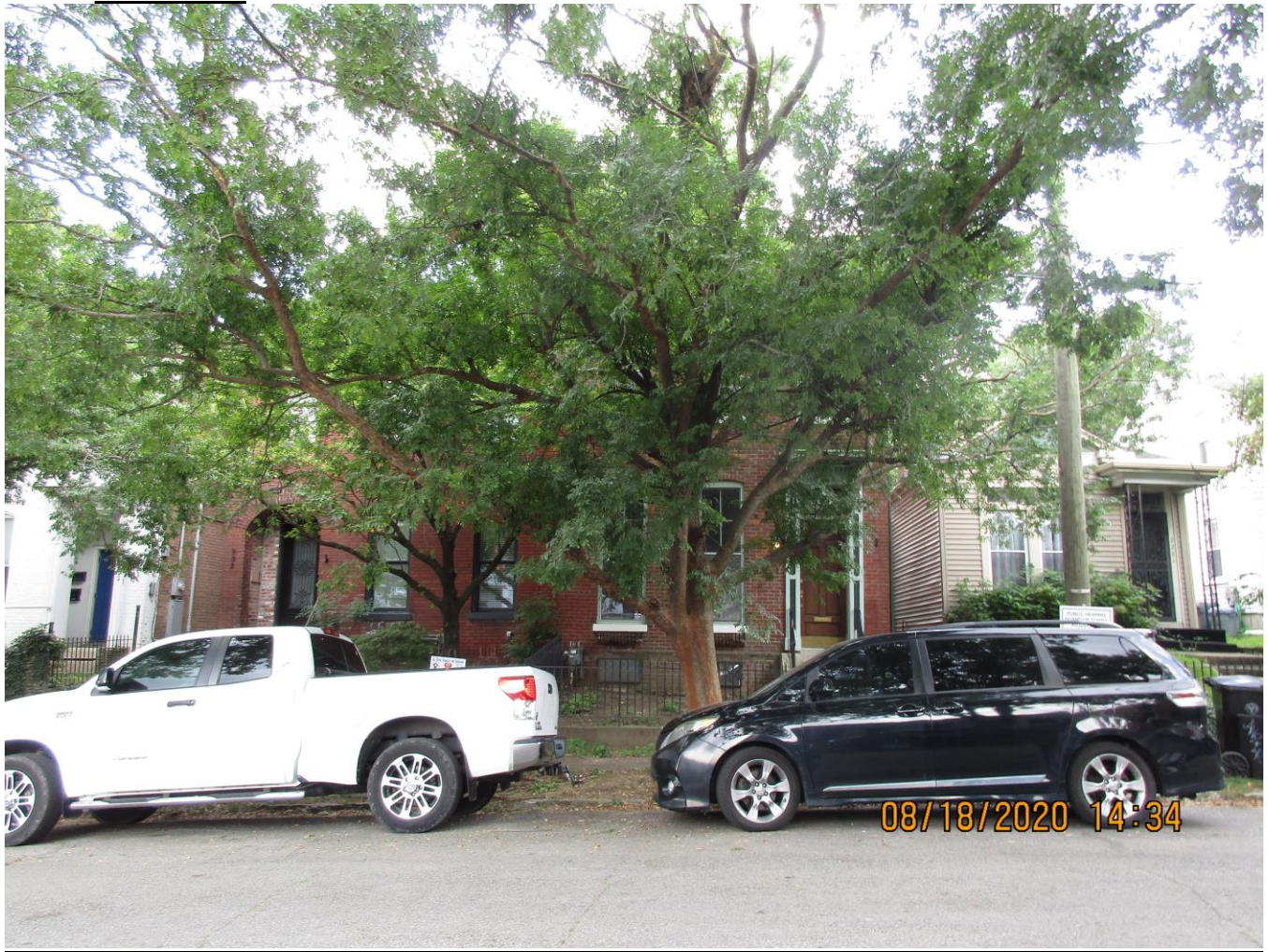
Front of subject property.