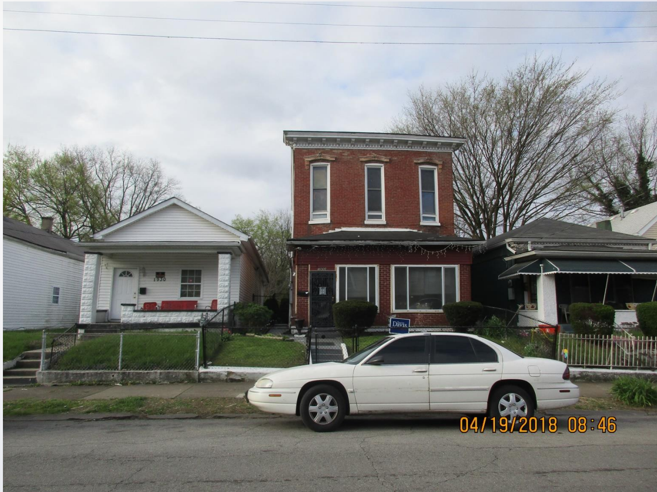
Adjoining Property to South