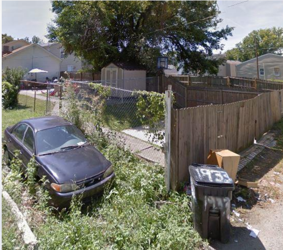
Rear Parking Pad