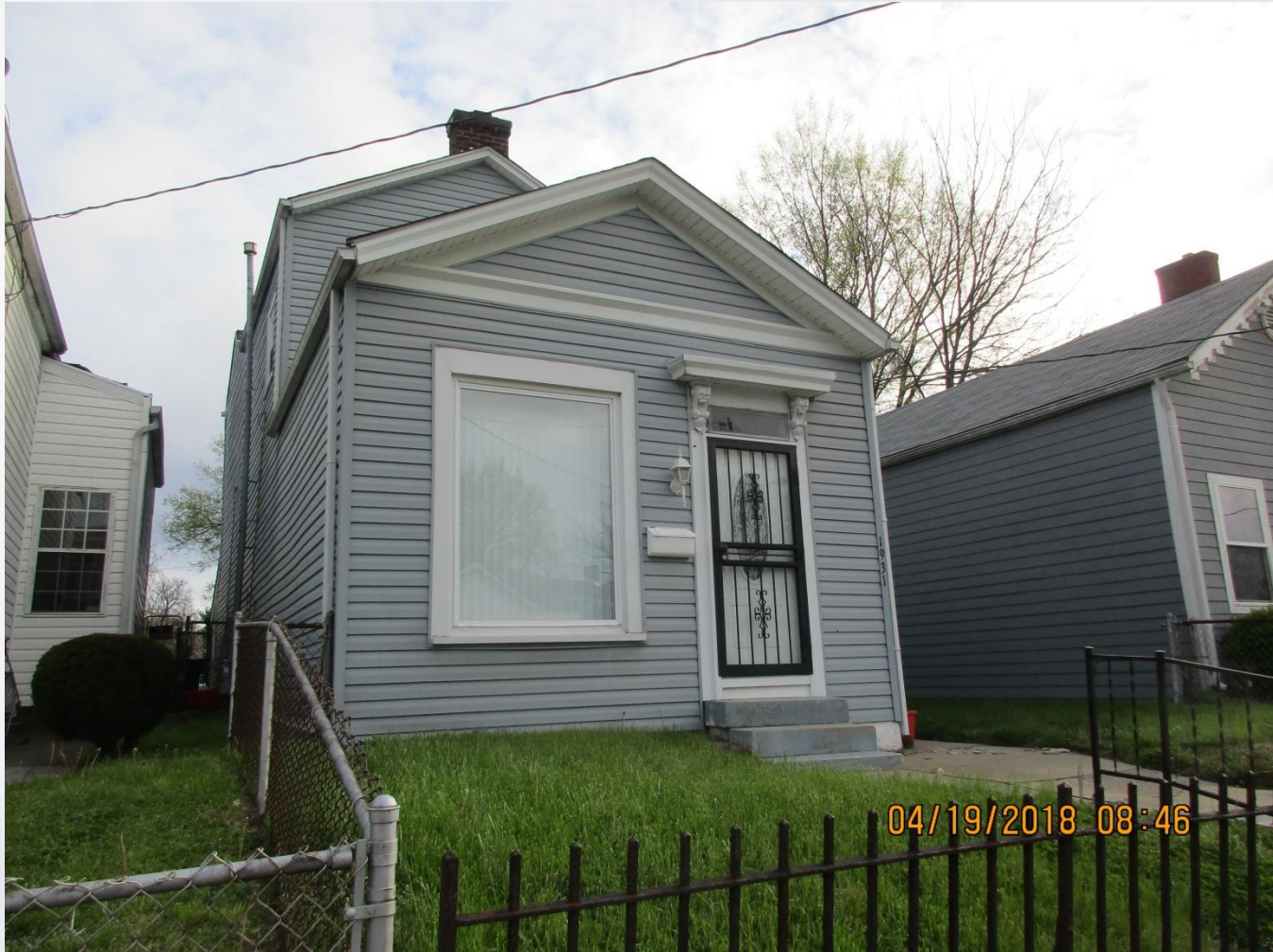
Adjoining Property to East