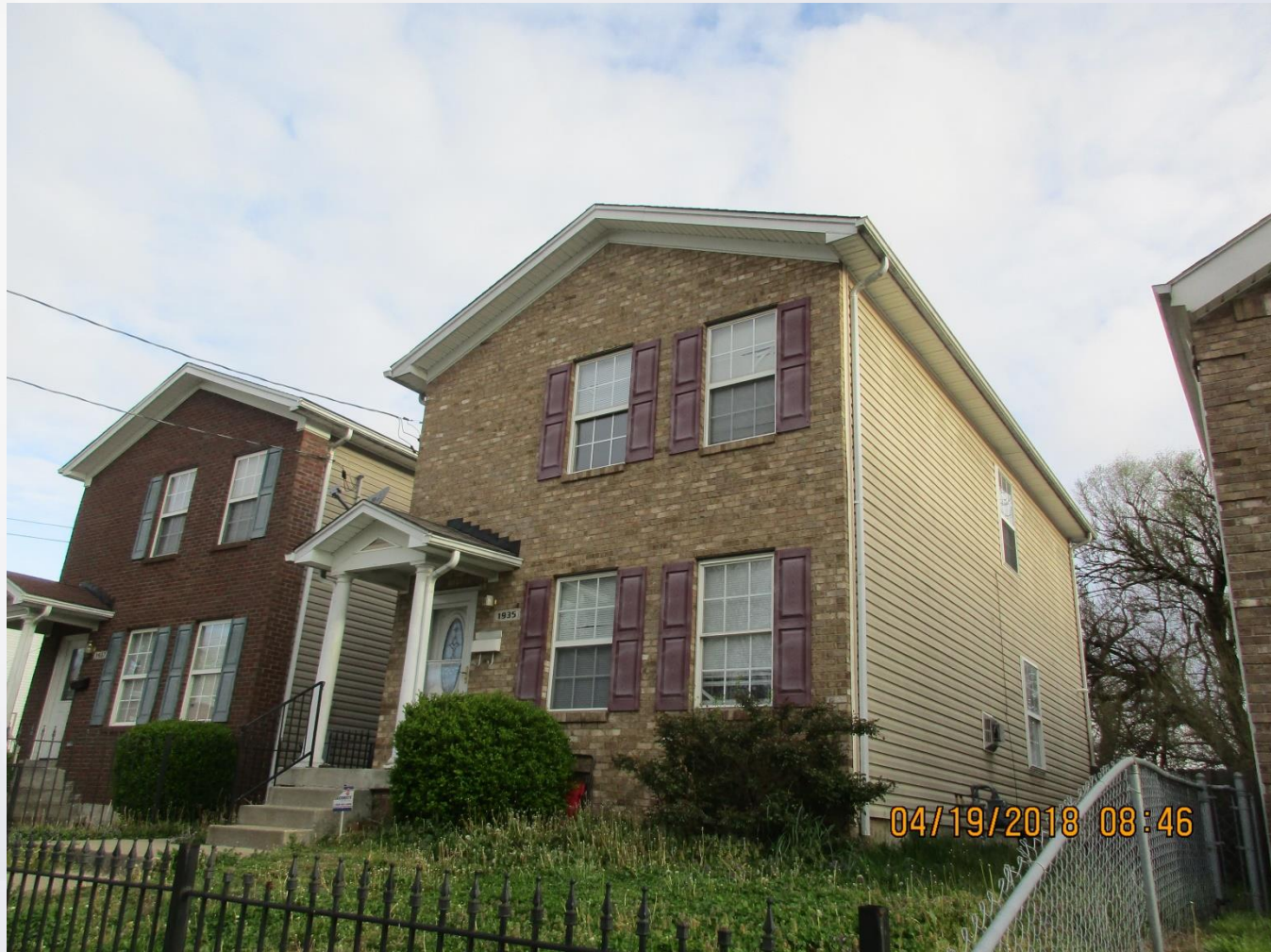
Adjoining Property to West