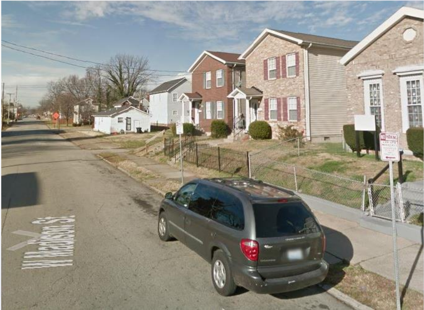
Drop-Off Area and On-Street Parking