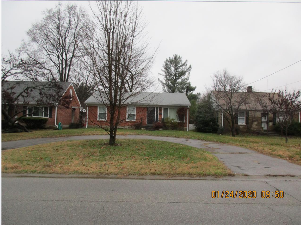
Property to the left.