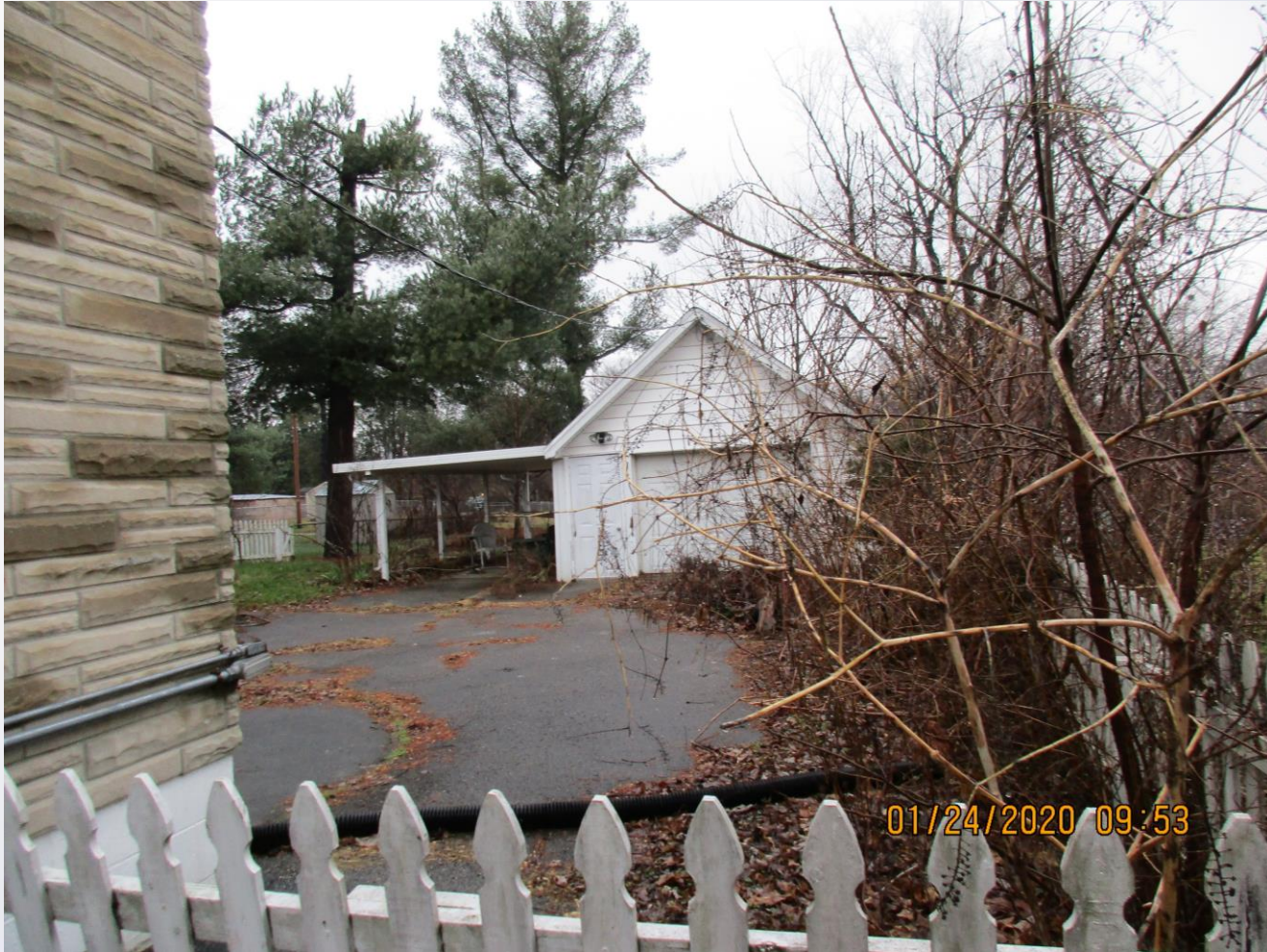
Garage and carport.