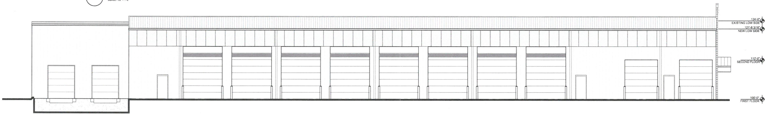
2 SIDE ELEVATION SCALE: 1/8" = 1'-0"