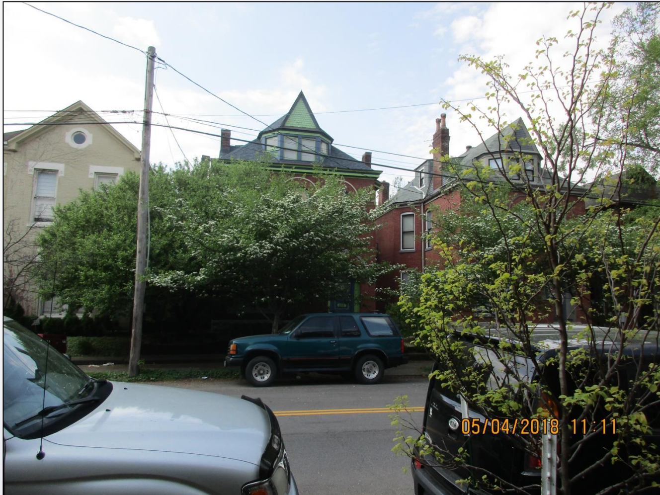
The properties across W St Catherine.