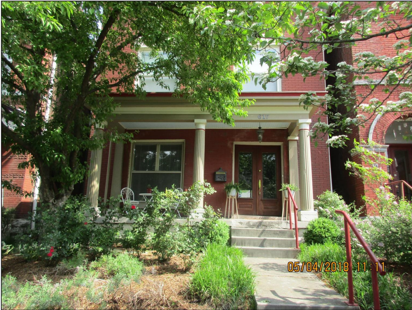
The front of the subject property.