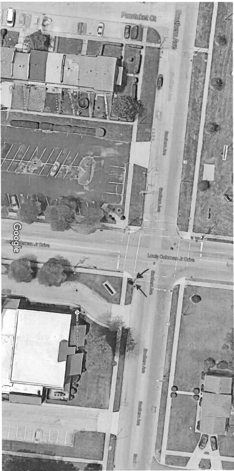
Imagery ©2016 Google, Map data ©2016 Google 20 ft