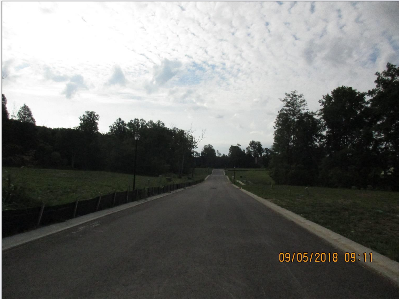
Looking south down Ginkgo Trail.