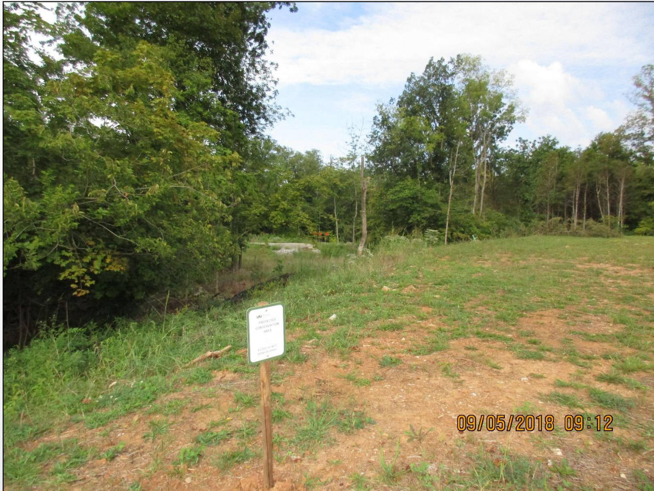
Looking into the site.