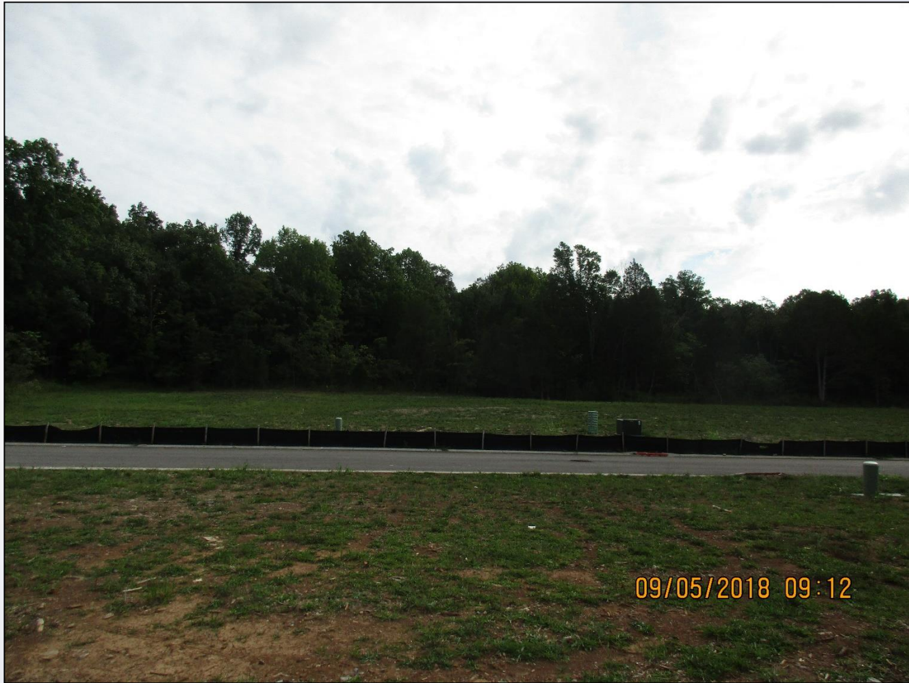
Looking into the site.