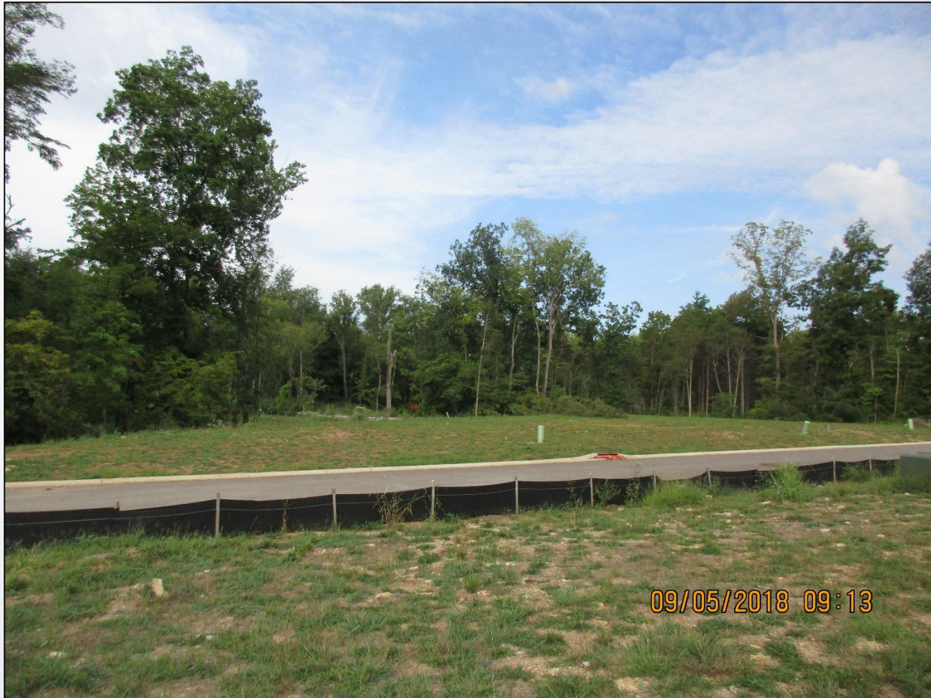
Looking into the site.