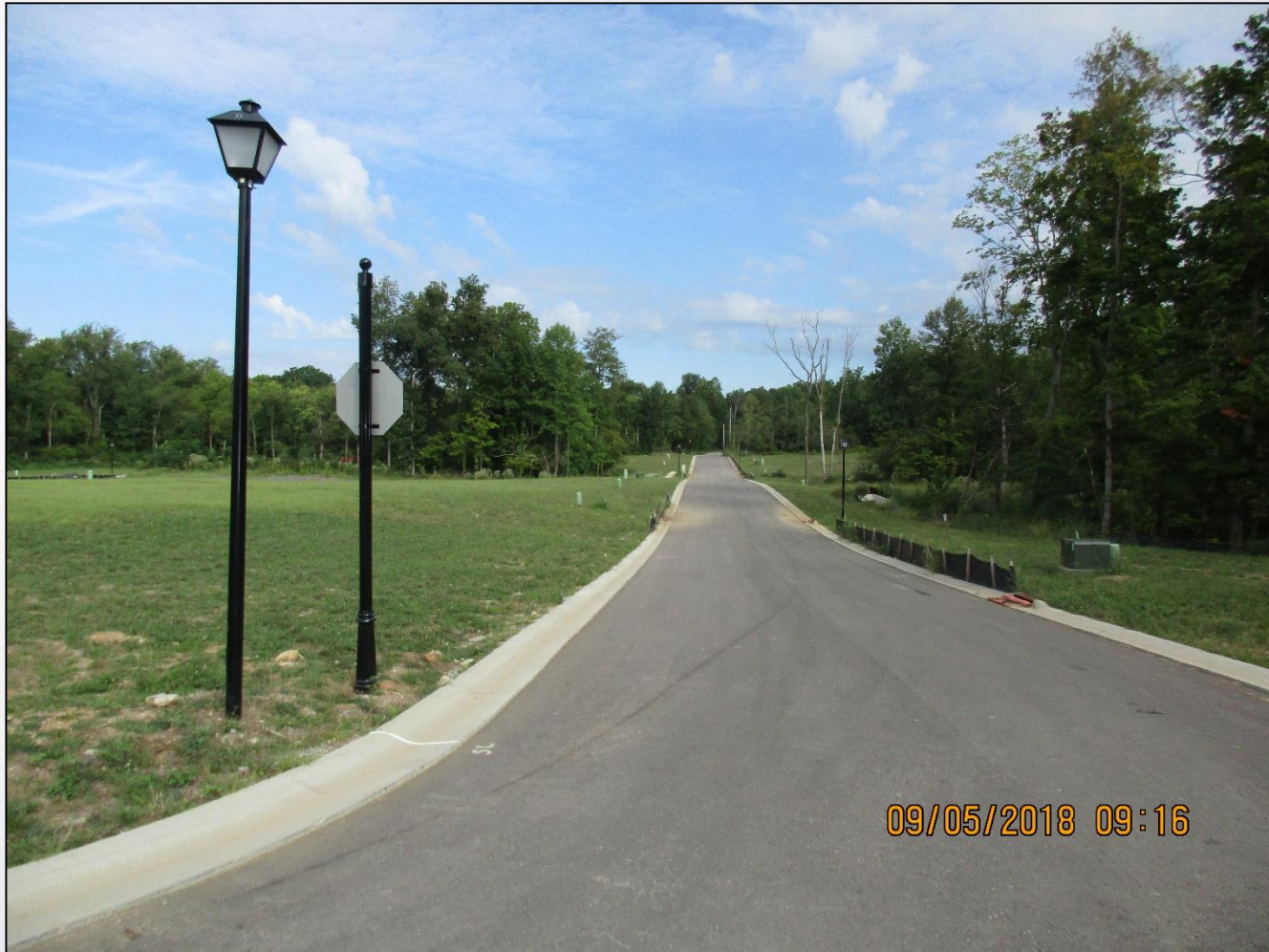
Looking north down Ginkgo Trail.