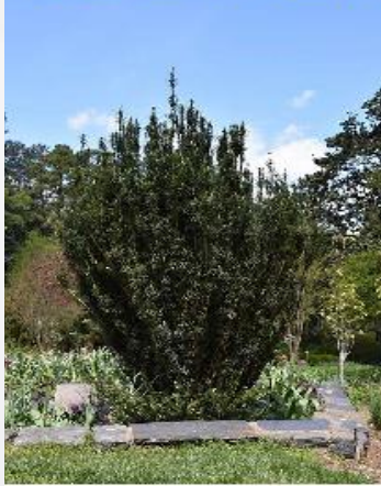
Upright Japanese Plum Yew Example

(5) Upright Japanese Plum Yew to screen getting installed Growth rate of 8" - 8" per year. Will grow to be about 10 feet tall at maturity, with a spread of 6 feet. It has a low canopy with a typical clearance of 1 foot from the ground