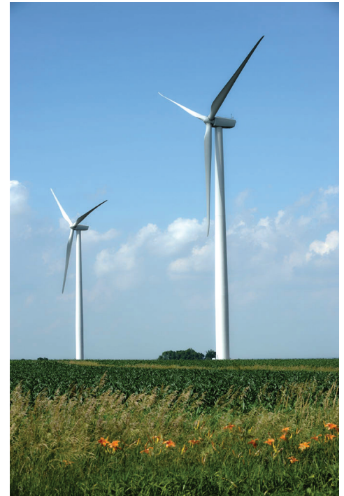
Rail Splitter Wind Farm, which achieved commercial operation in September 2009, is located just north of Lincoln, IL. This represents the many wind farms the Green Energy Program has supported over the years.

For more information, please contact your LG&E and KU representative, visit lge-ku.com/green or send us an email at green.energy@lge-ku.com . We look forward to partnering with you to meet your sustainability goals.