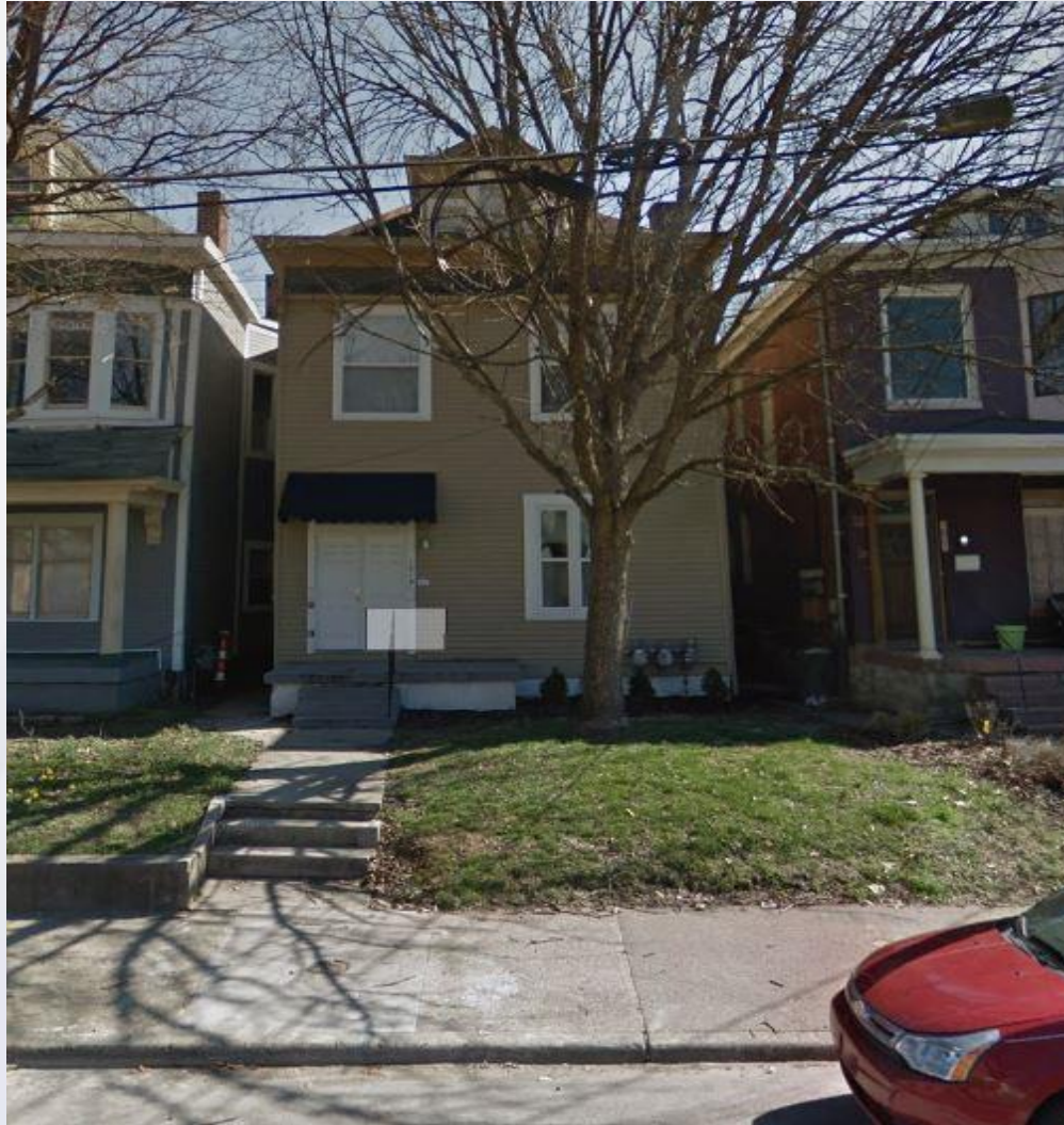
Adjacent to North