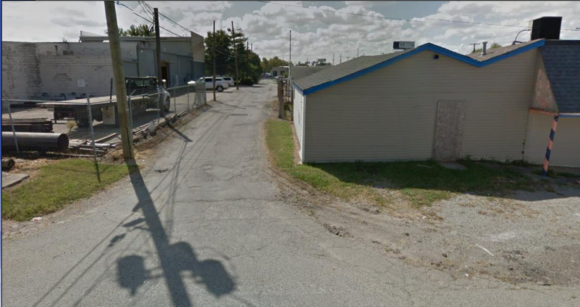
Northside of alley, Looking South