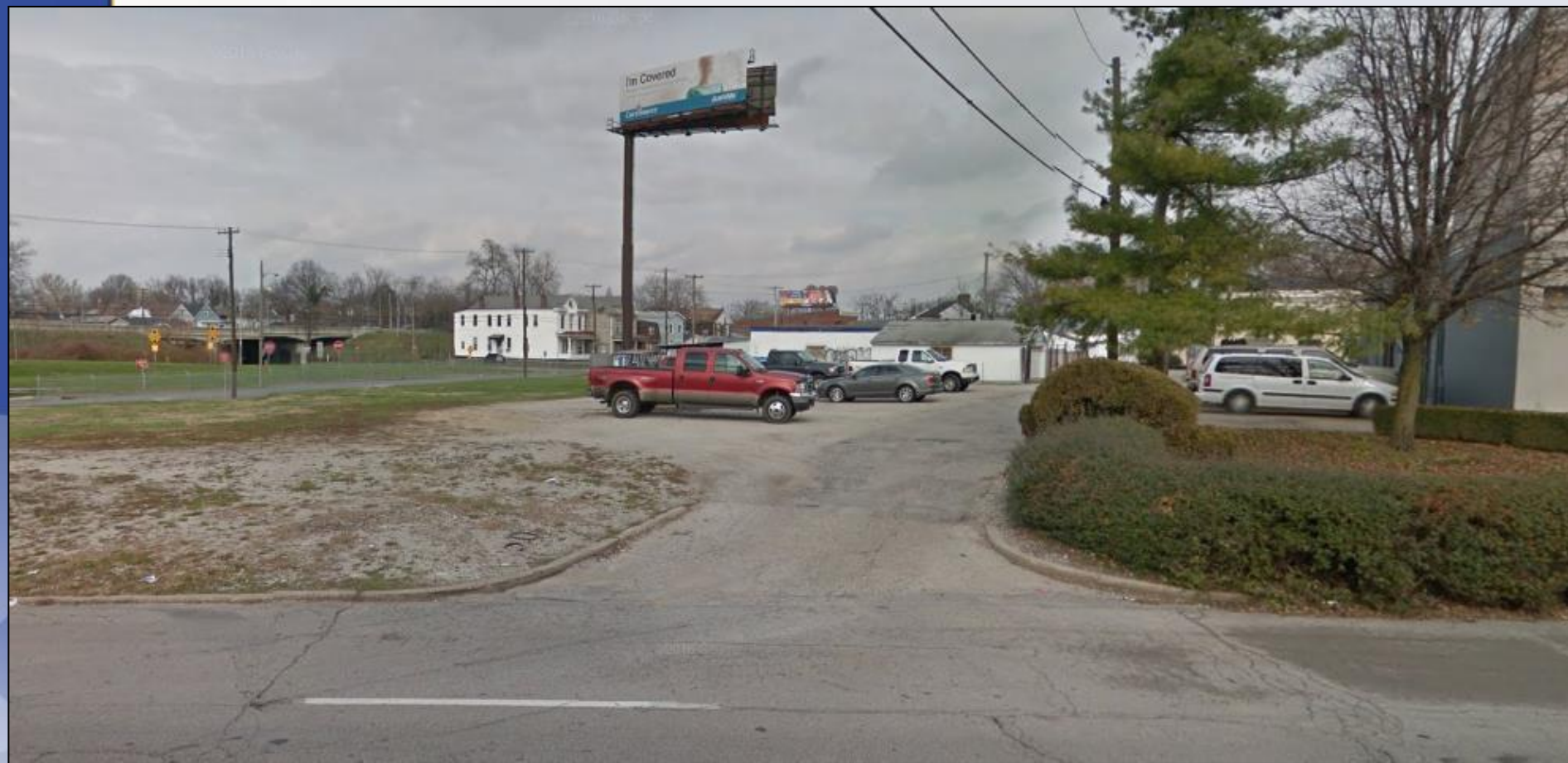
Southside of alley, looking North