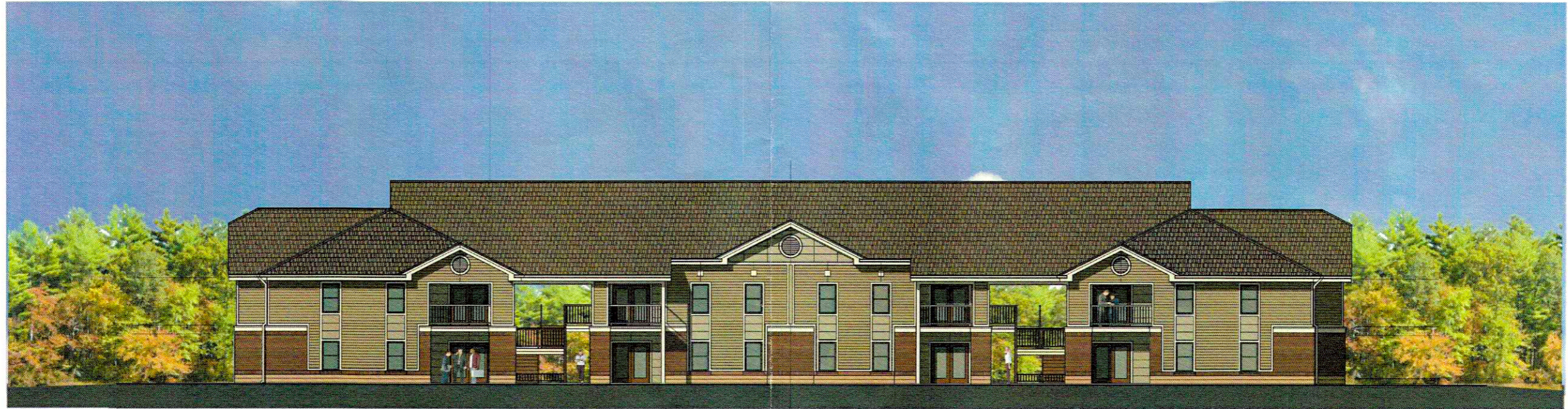
FRONT / REAR ELEVATIONS SCALE: \frac{1}{8}'' = 1'-0''