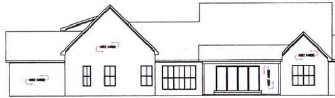
REAR ELEVATION 1/8" = 10'