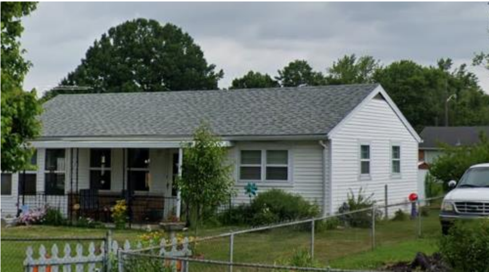
7317 Dunkirk Ln; Approximately 27.45 ft. wide; measured with Lojic.org