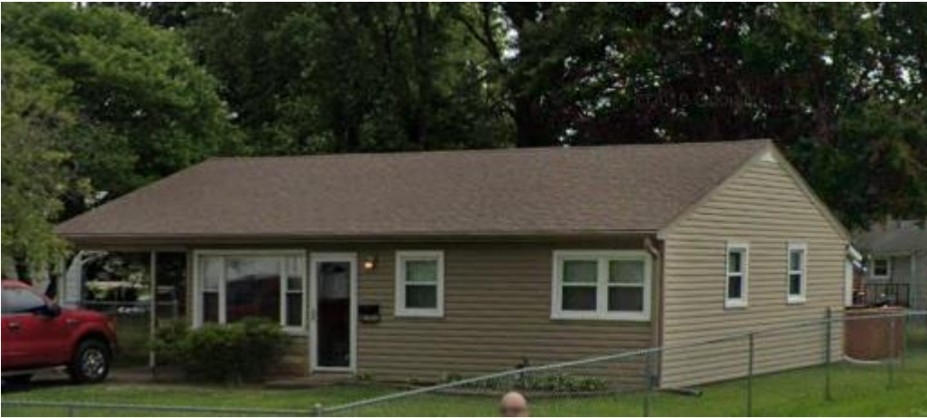
13605 Tennis Blvd; Approximately 27.5 ft. wide, measured with Lojic.org