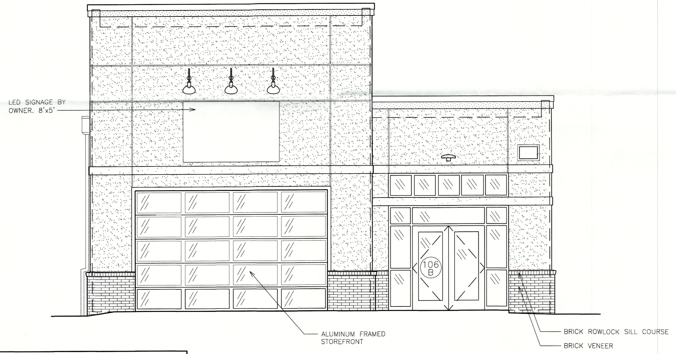
B1 EXIT ELEVATION 1/4" = 1'-0"