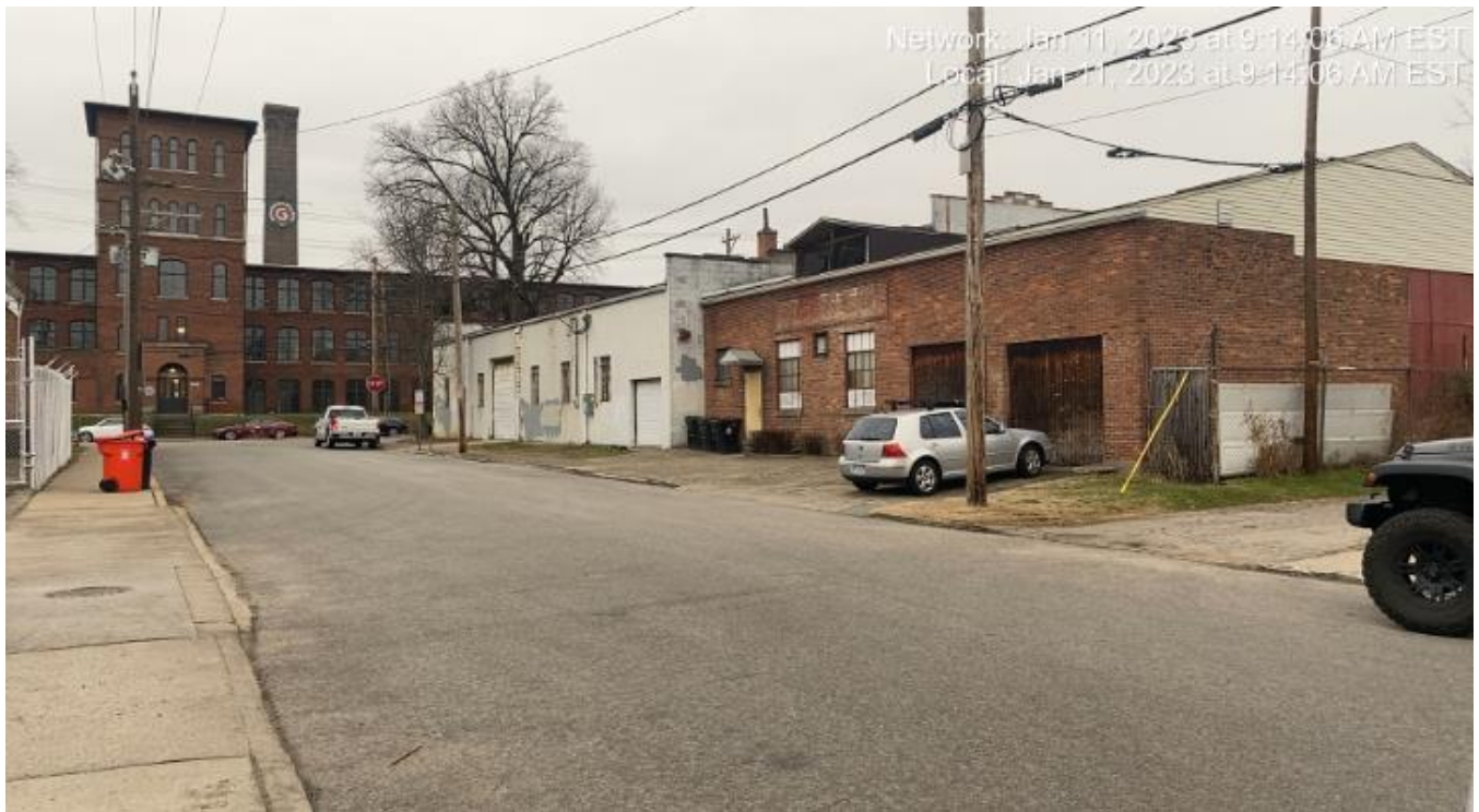
Property to the left of subject site