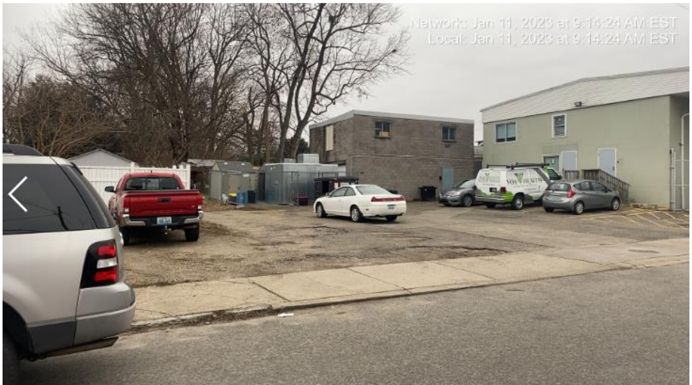
Properties across the street from the subject site.