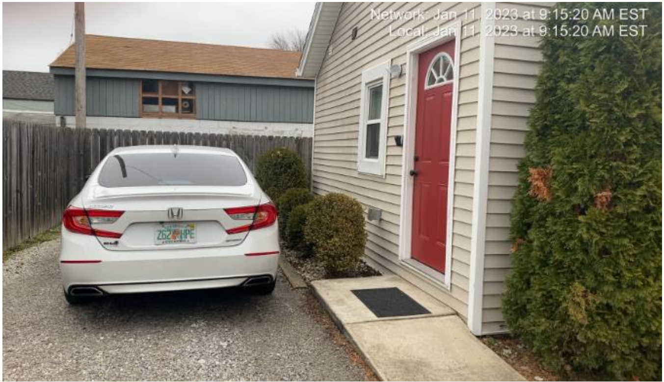
Rear Parking Pad