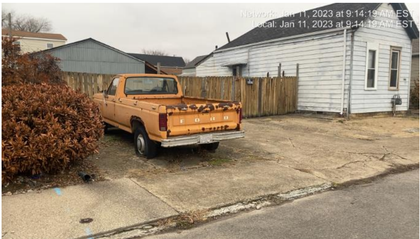
Property to the right of subject site