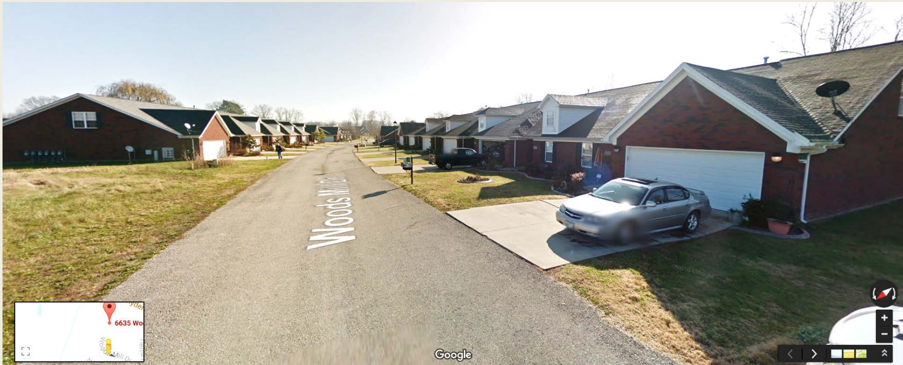
View of existing patio homes within the development.