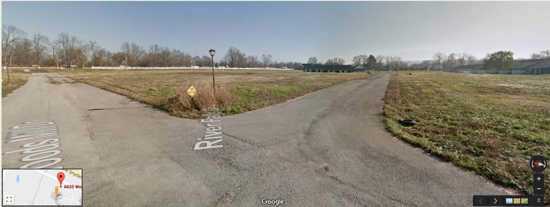
View of site looking northwardly towards Moorman Road.