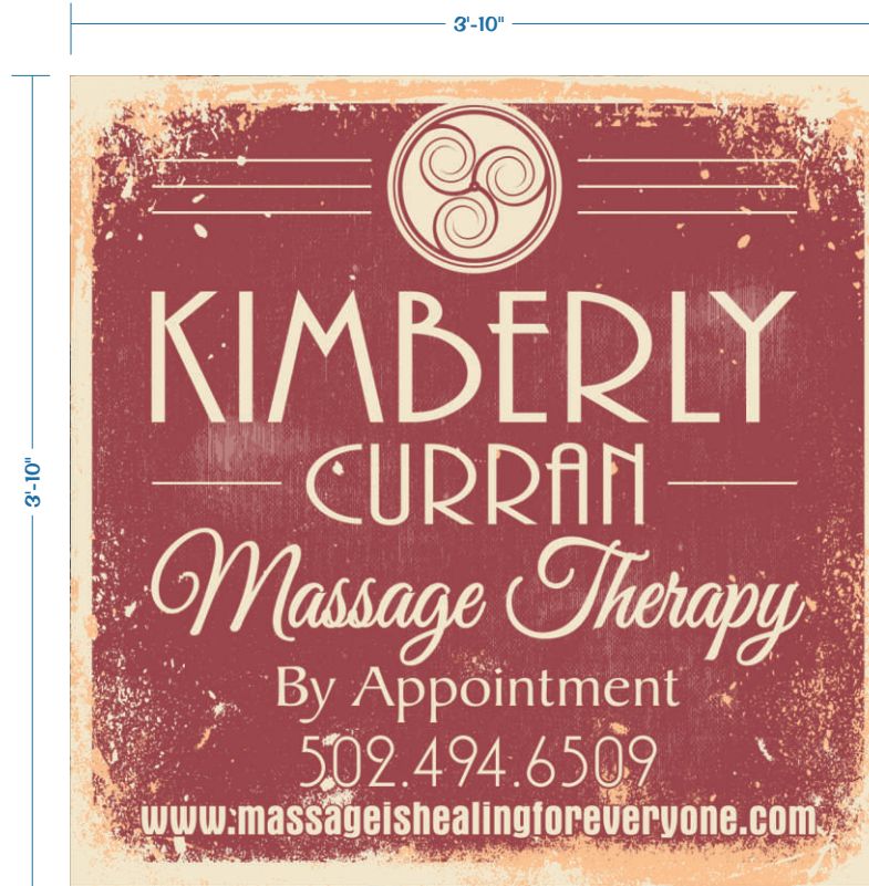
S/F 1" Aluminum Pan Sign with Digitally Printed Graphics