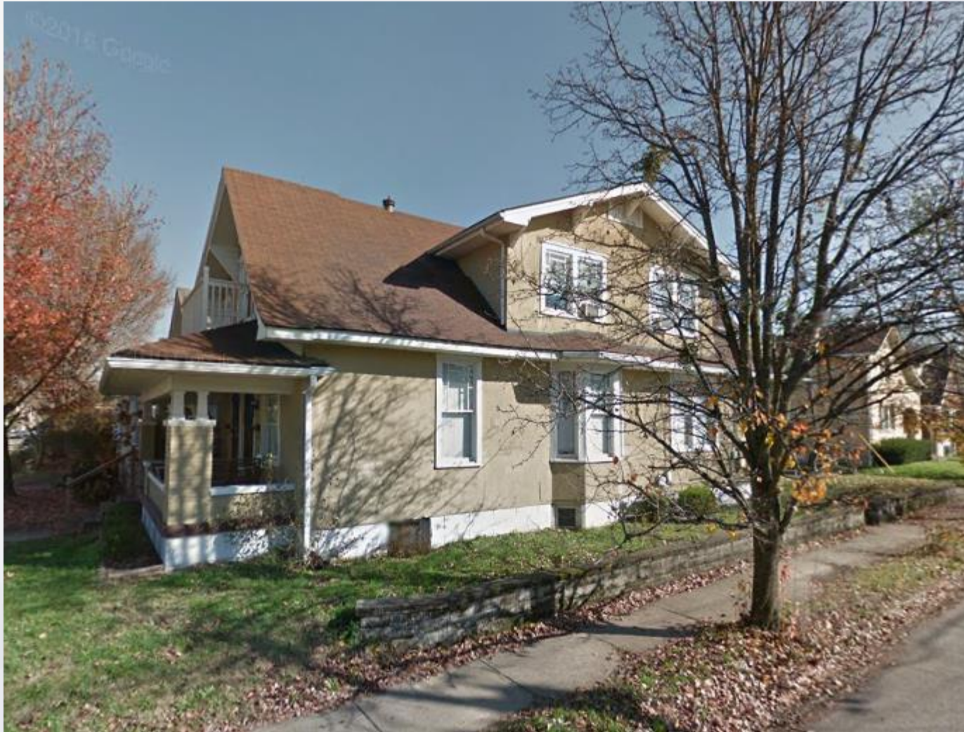
Across to West