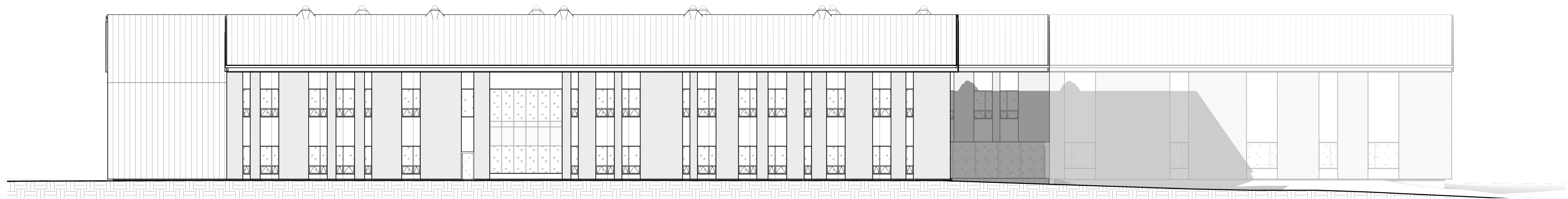
2 OVERALL BUILDING ELEVATION - SOUTH 3/32" = 1'-0"