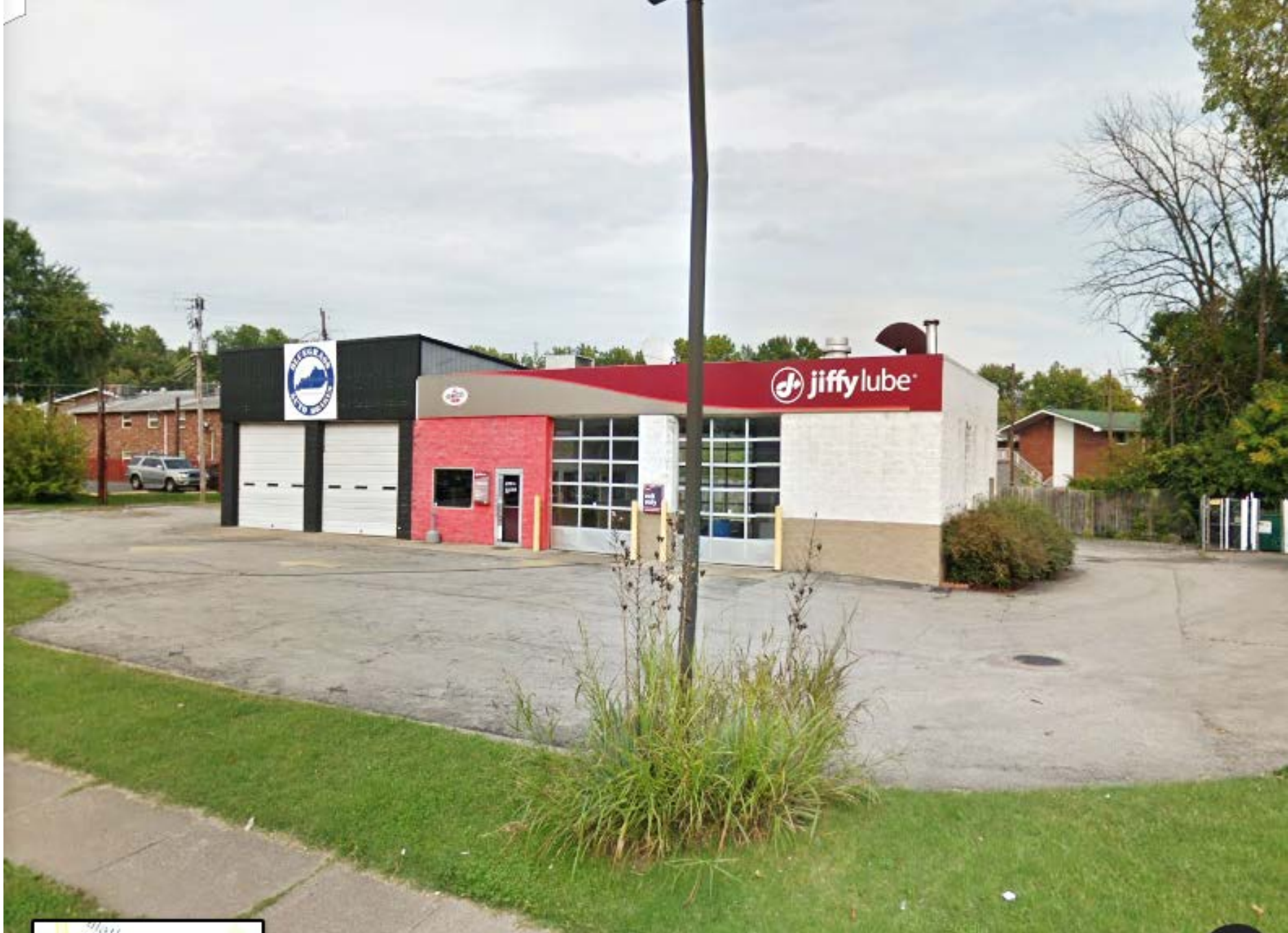
View of businesses along New Cut Road, which adjoin the subject site to the west (rear).