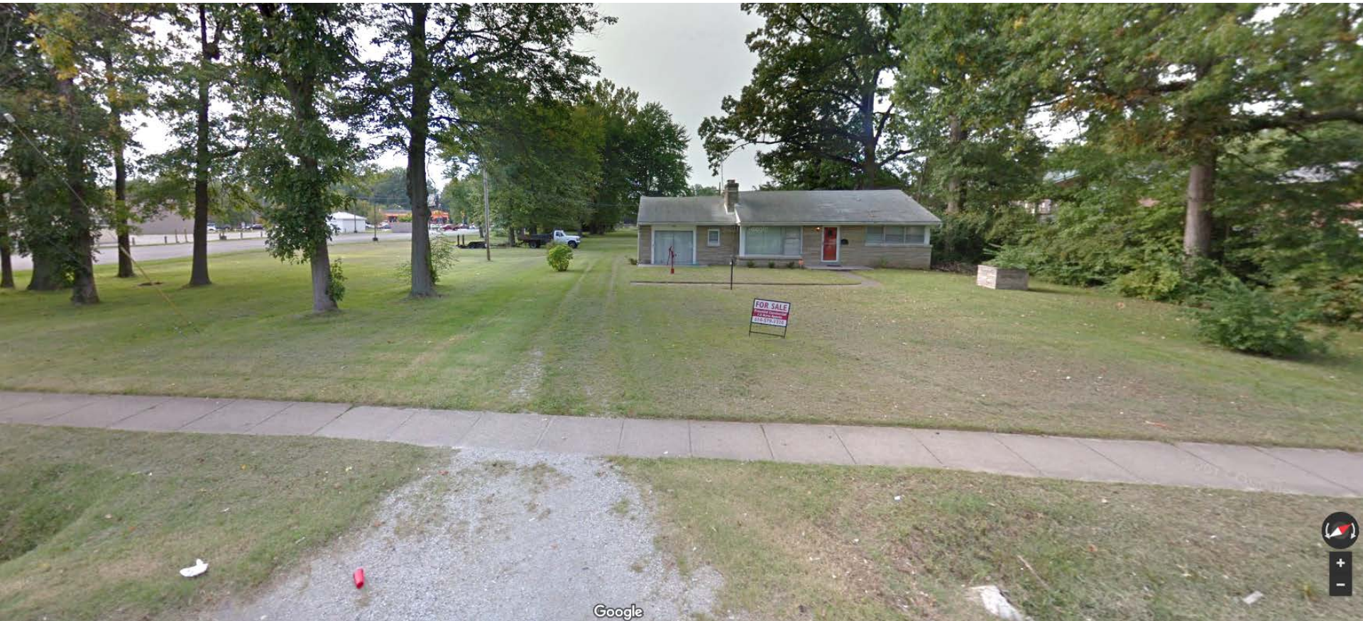
View of site from Southside Drive.