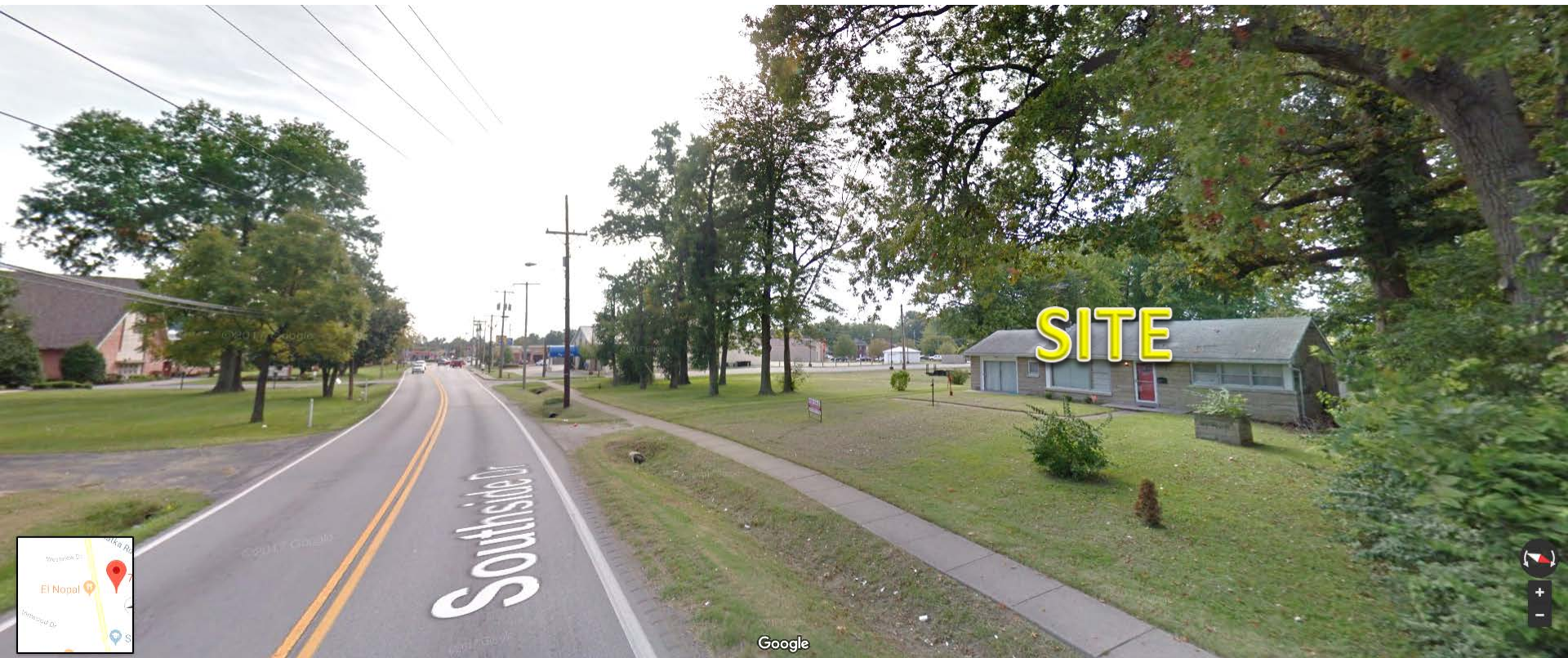
View Southside Drive looking southwest. Site is to the right.