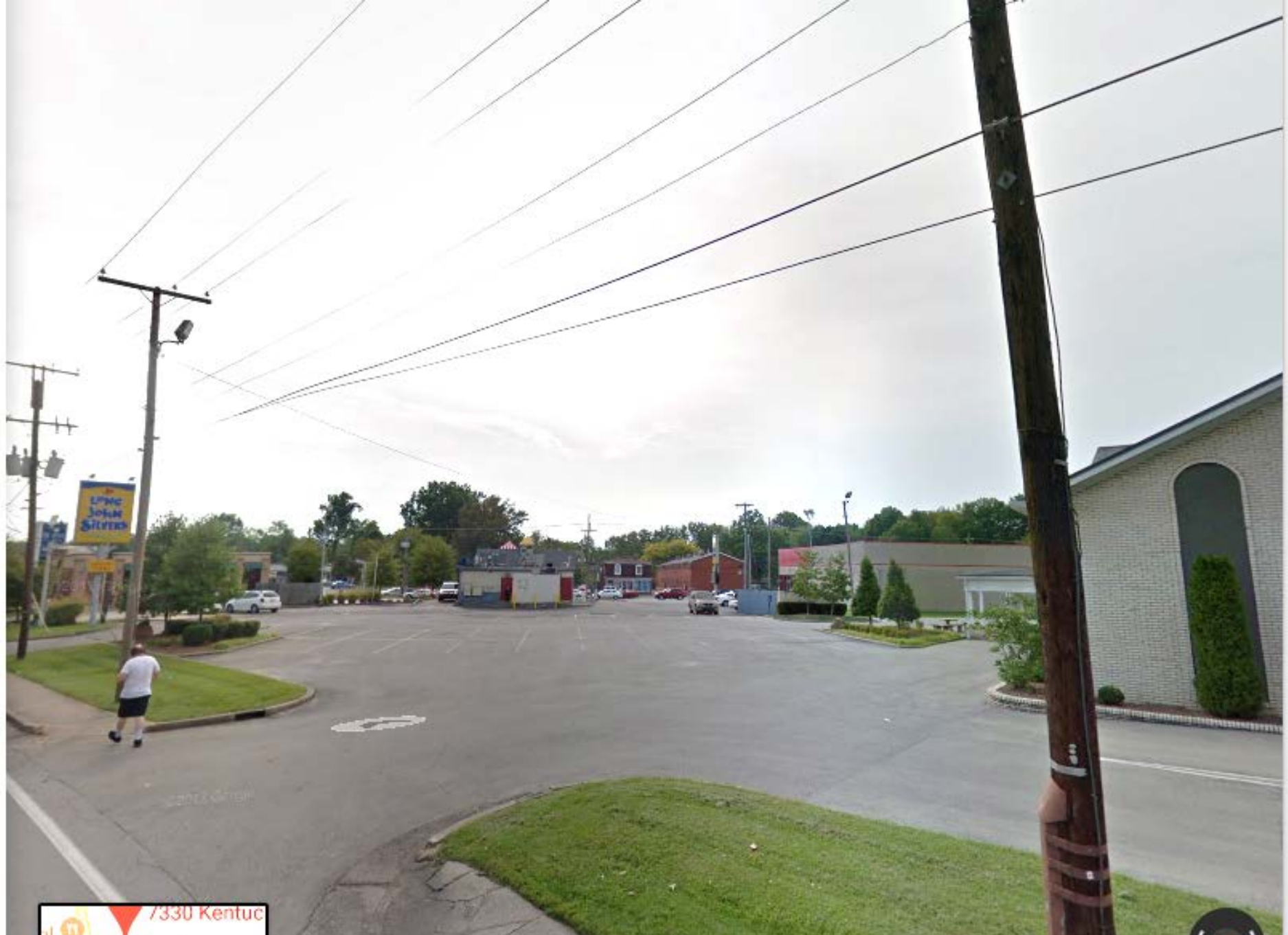
View of Ratterman Funeral Home parking lot towards businesses along New Cut Road.