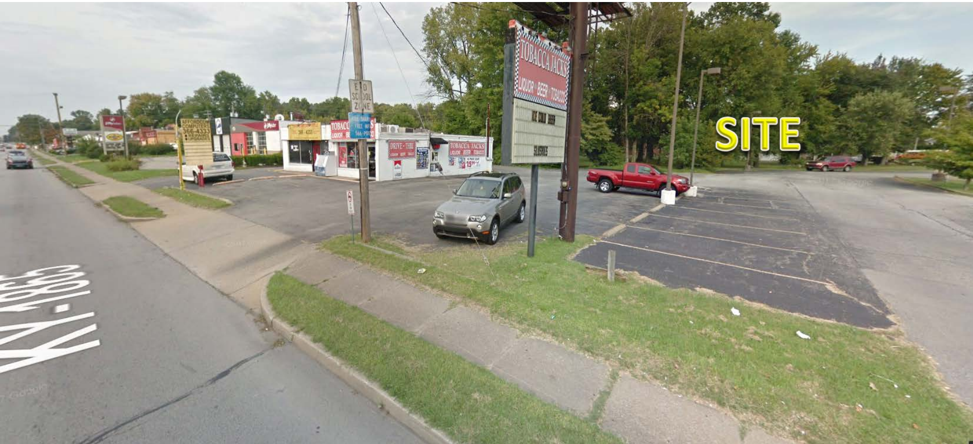
View of businesses along New Cut Road, which adjoin the subject site to the west (rear).