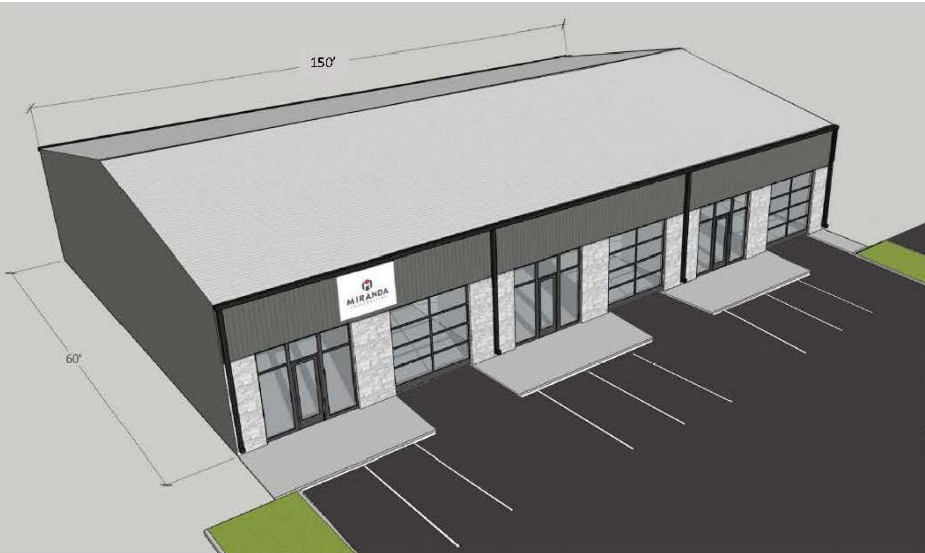
Proposed style and design of building