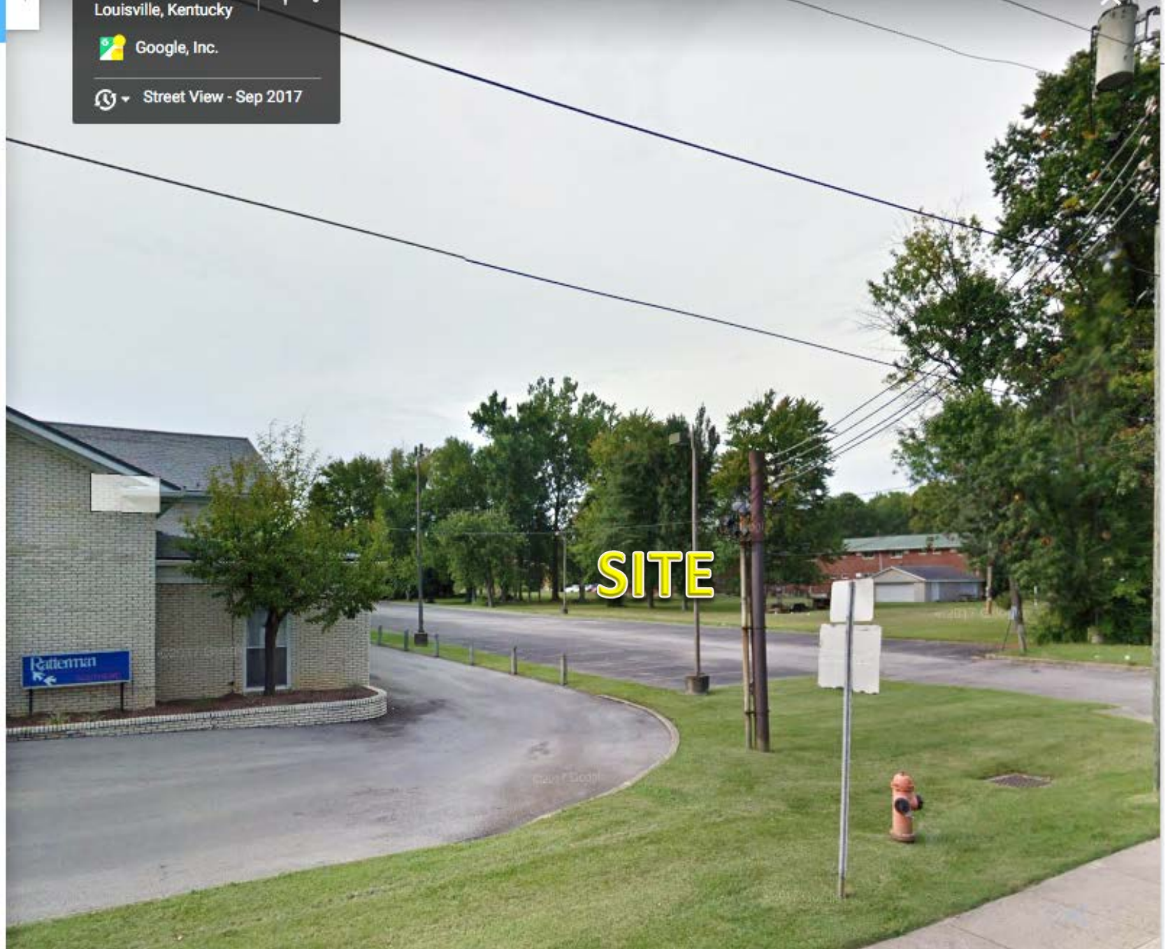
View of Ratterman Funeral Home parking lot, which adjoins the site to the south.