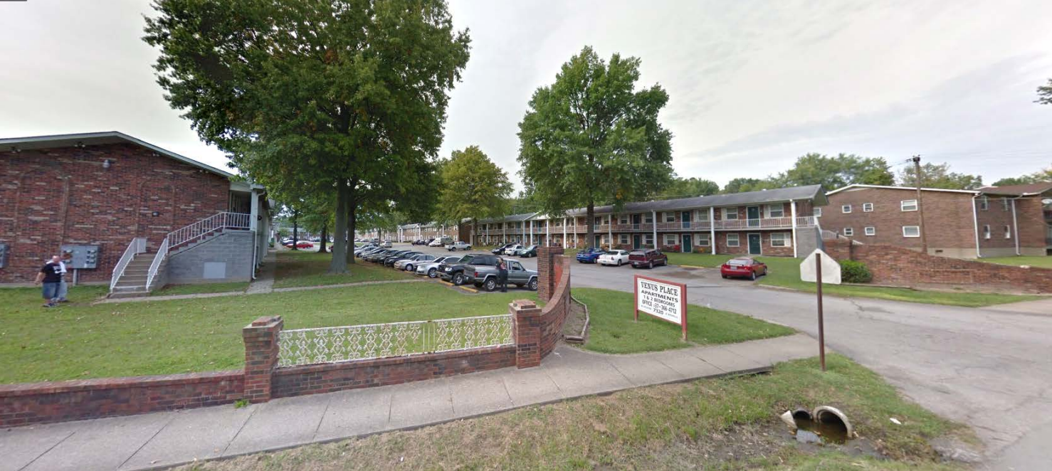
Apartments located to the north of the site.