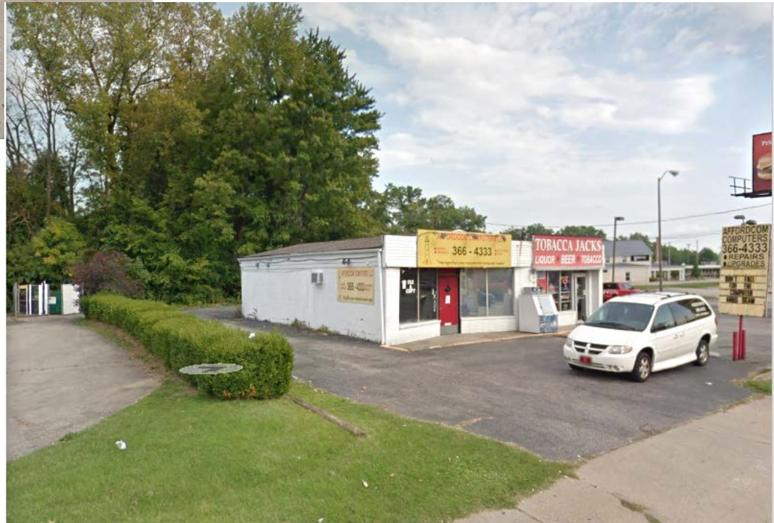
View of businesses along New Cut Road, which adjoin the subject site to the west (rear).