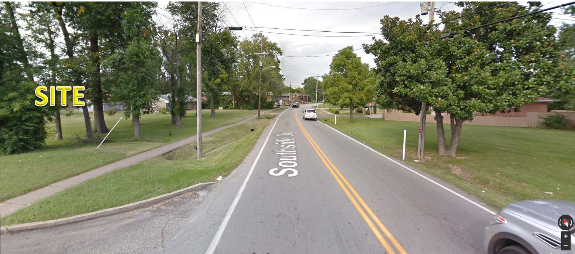
View Southside Drive looking northeast. Site is to the left.