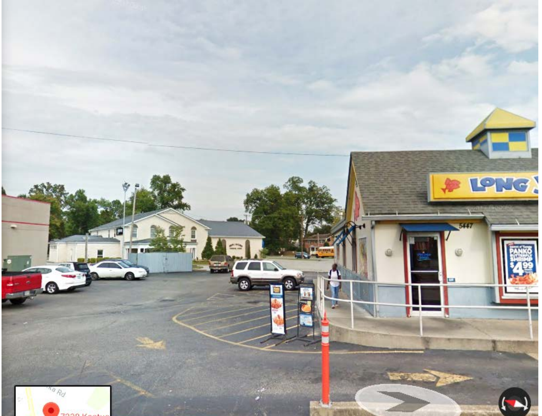
View of businesses along New Cut Road.