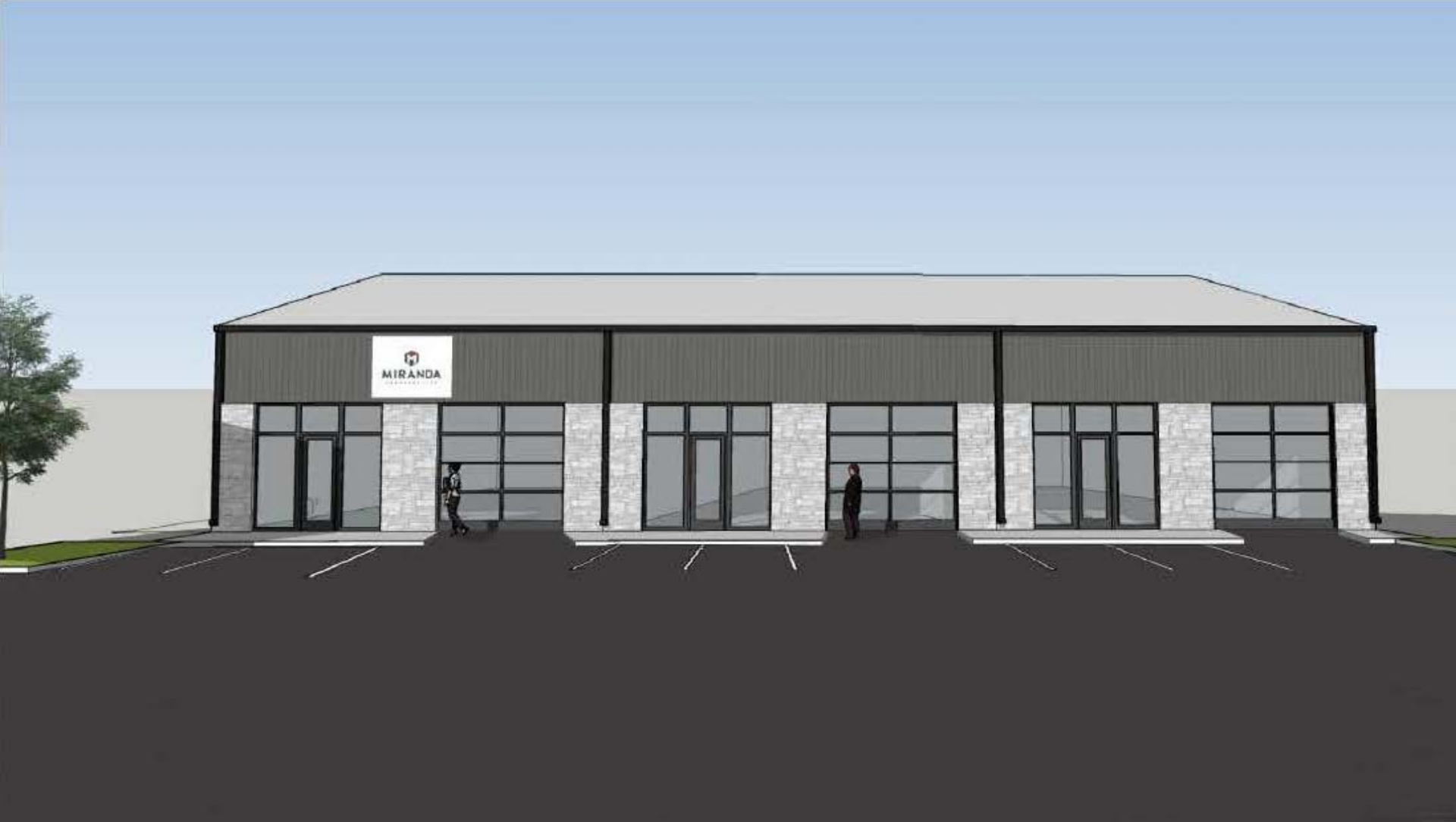
Proposed style and design of building