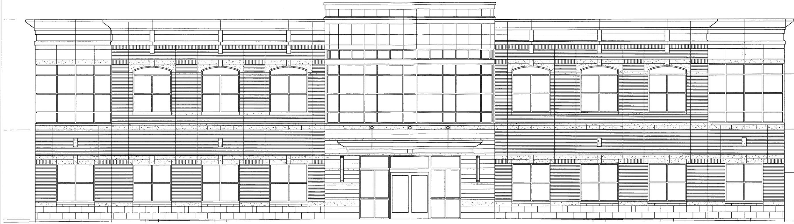
1 A3 FRONT ELEVATION SCALE: 1/4"=1'-0"

RECEIVED OCT 10 2014 PLANNING & DESIGN SERVICES