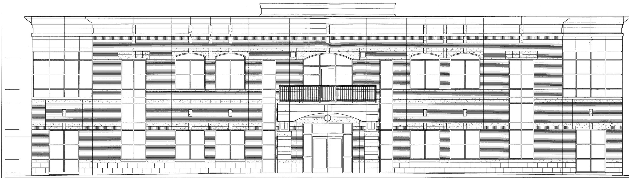
1 A3 REAR ELEVATION SCALE: 1/4"=1'-0"

PARAPET ROOF HGT. EL. 131'-4" AVERAGE ROOF LVL. EL. 128'-0" SECOND FLR. LVL. EL. 114'-0" FIRST FLR. LVL. EL. 100'-0"