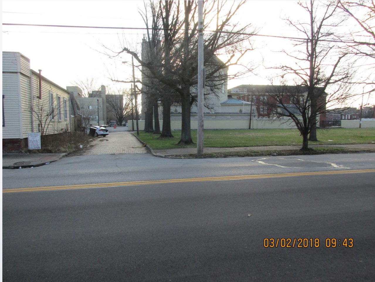
Adjacent to South