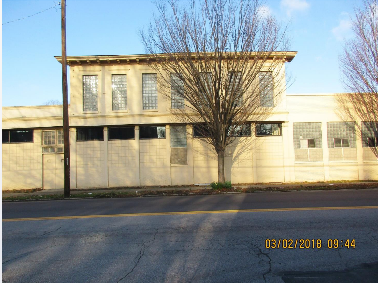
Adjacent to West