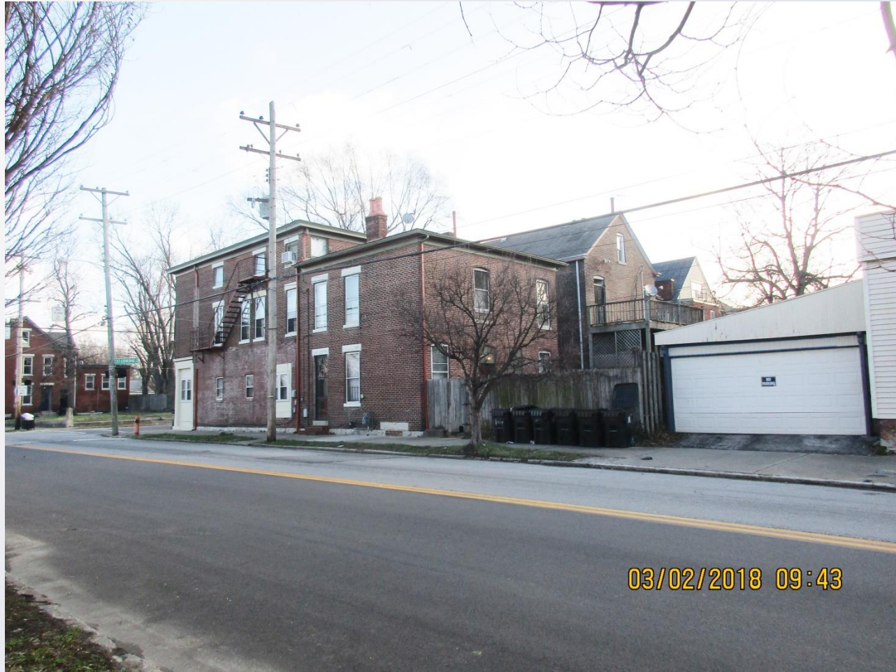
Adjacent to North