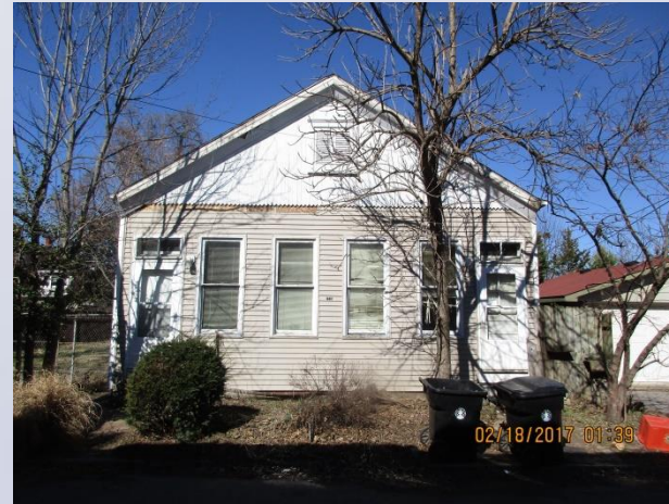
1518R rear (alley view)