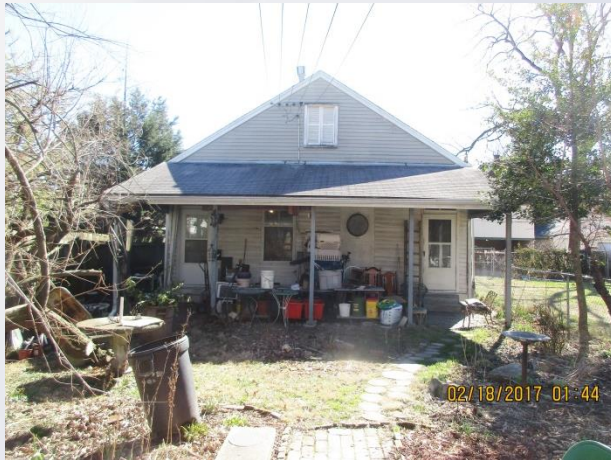
1518R front (interior to site)