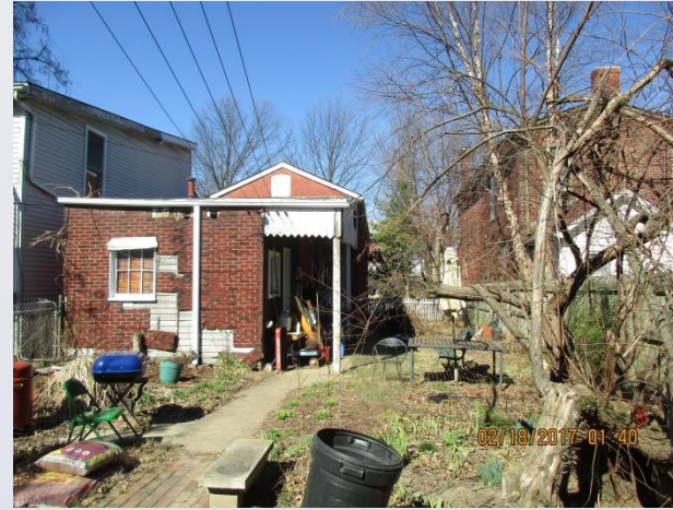
1518 rear (interior to site)