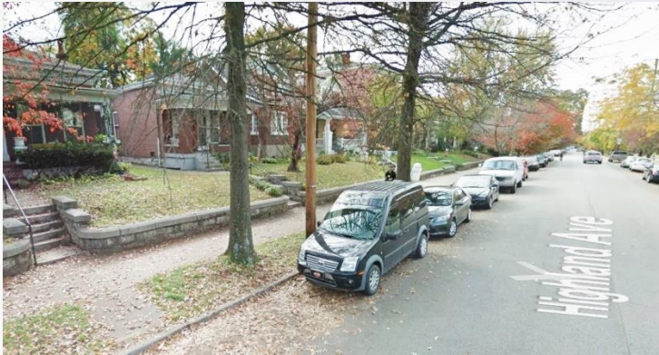
Highland Ave. toward Rubel Ave.