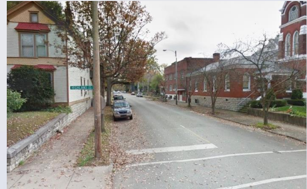
Rubel Ave. from Highland Ave.