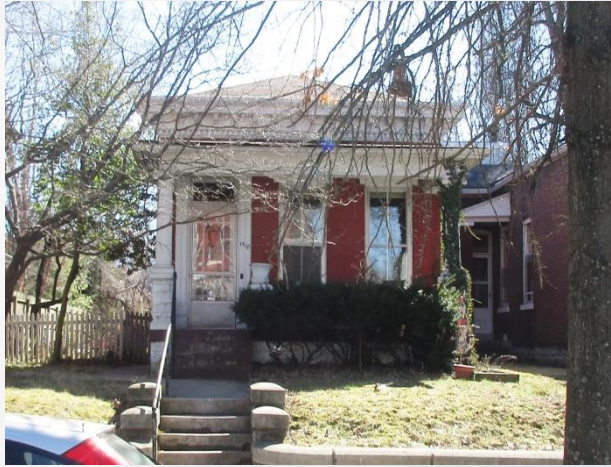
1518 front (street view)