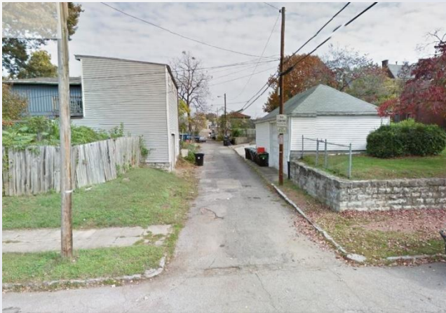
East into alley off Rubel Ave.