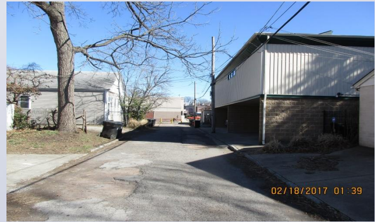
Duplex on left of alley