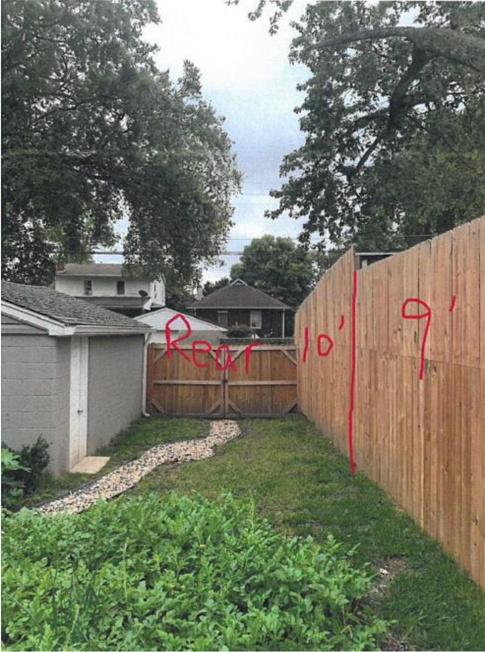
View of fence from rear of house.