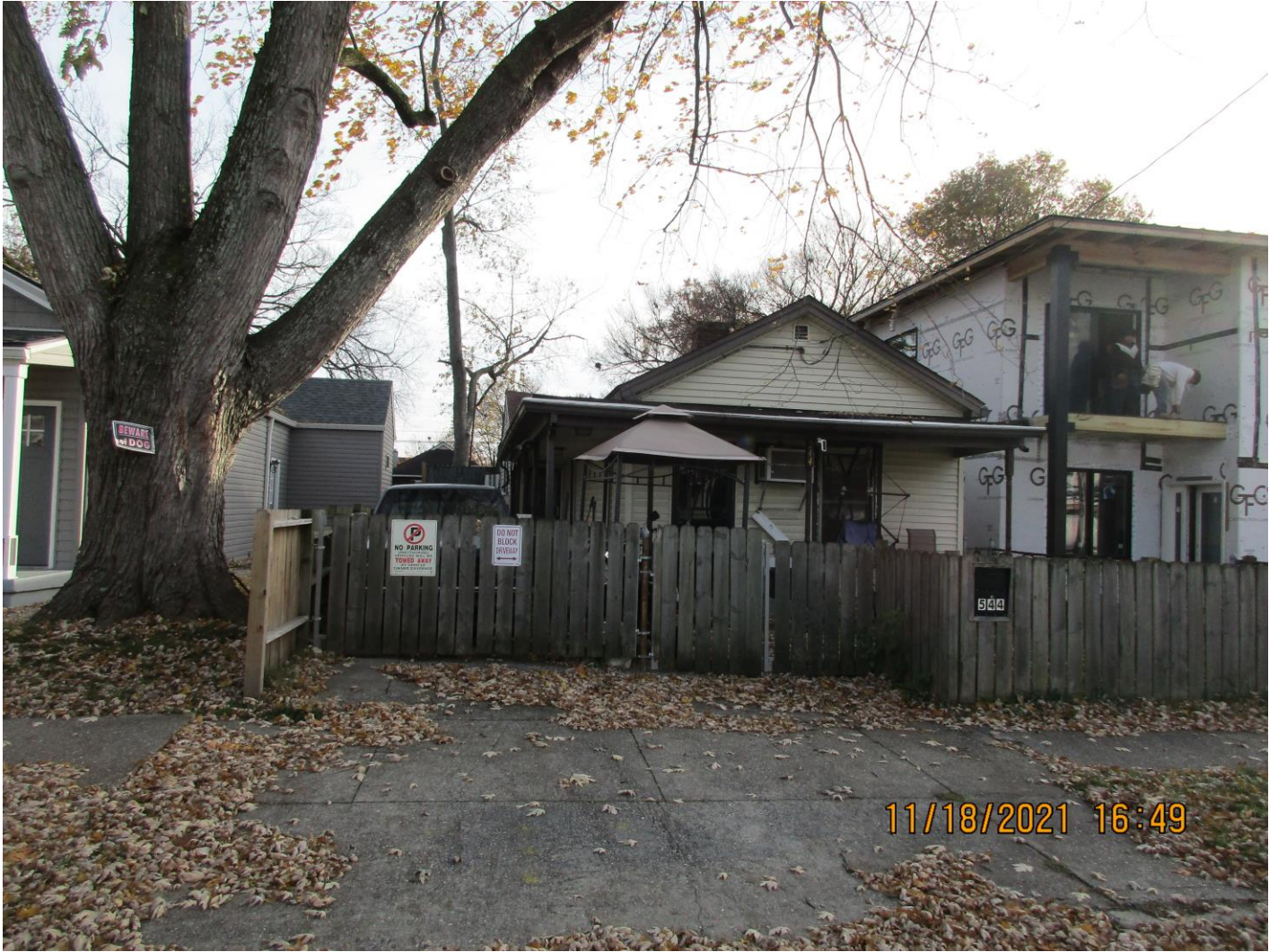
Property to the right.