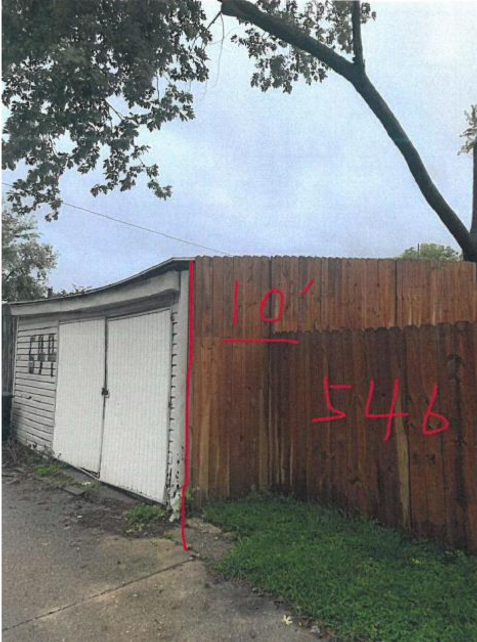
View of fence from alley.