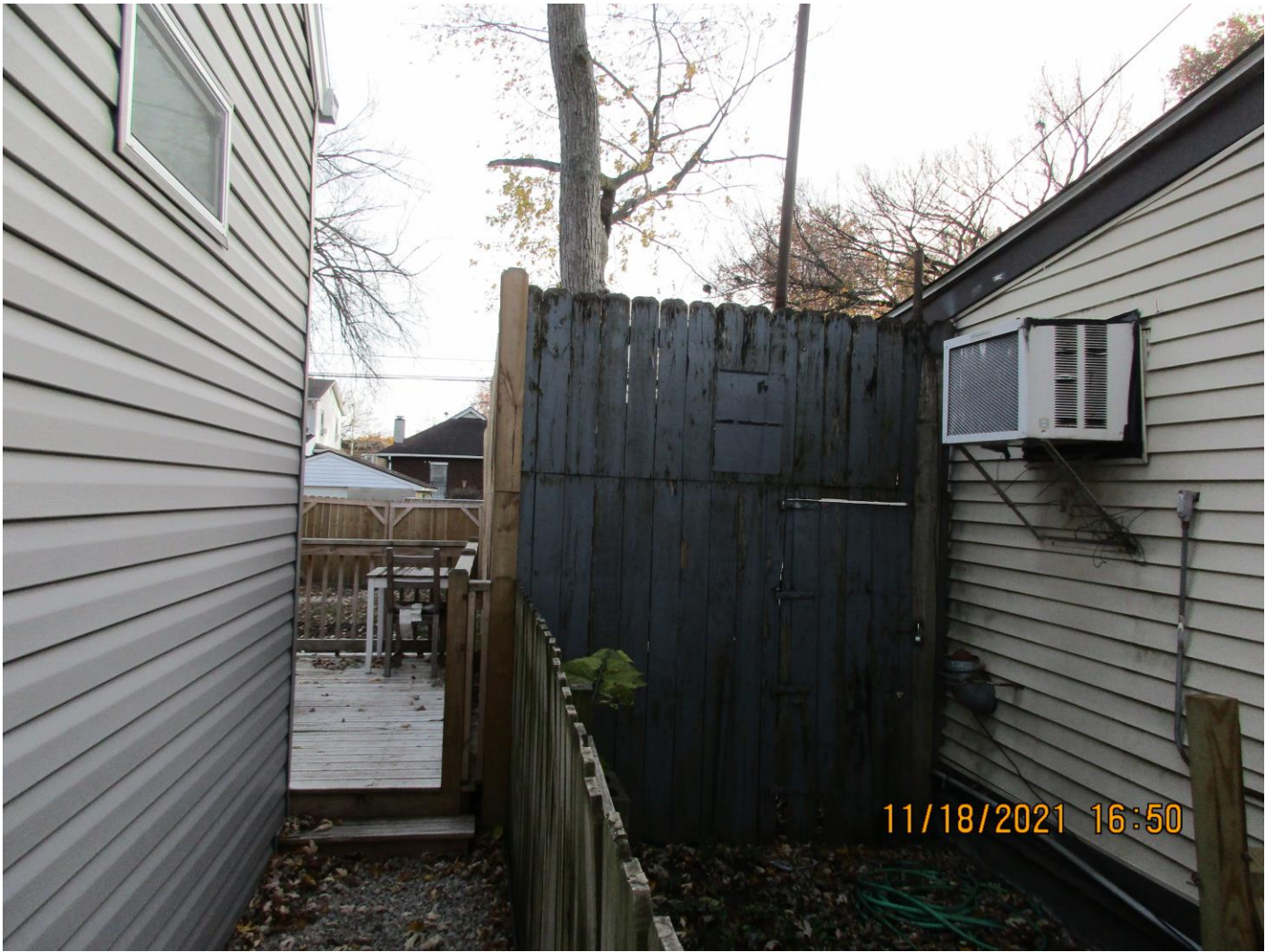
View of variance area from side yard.