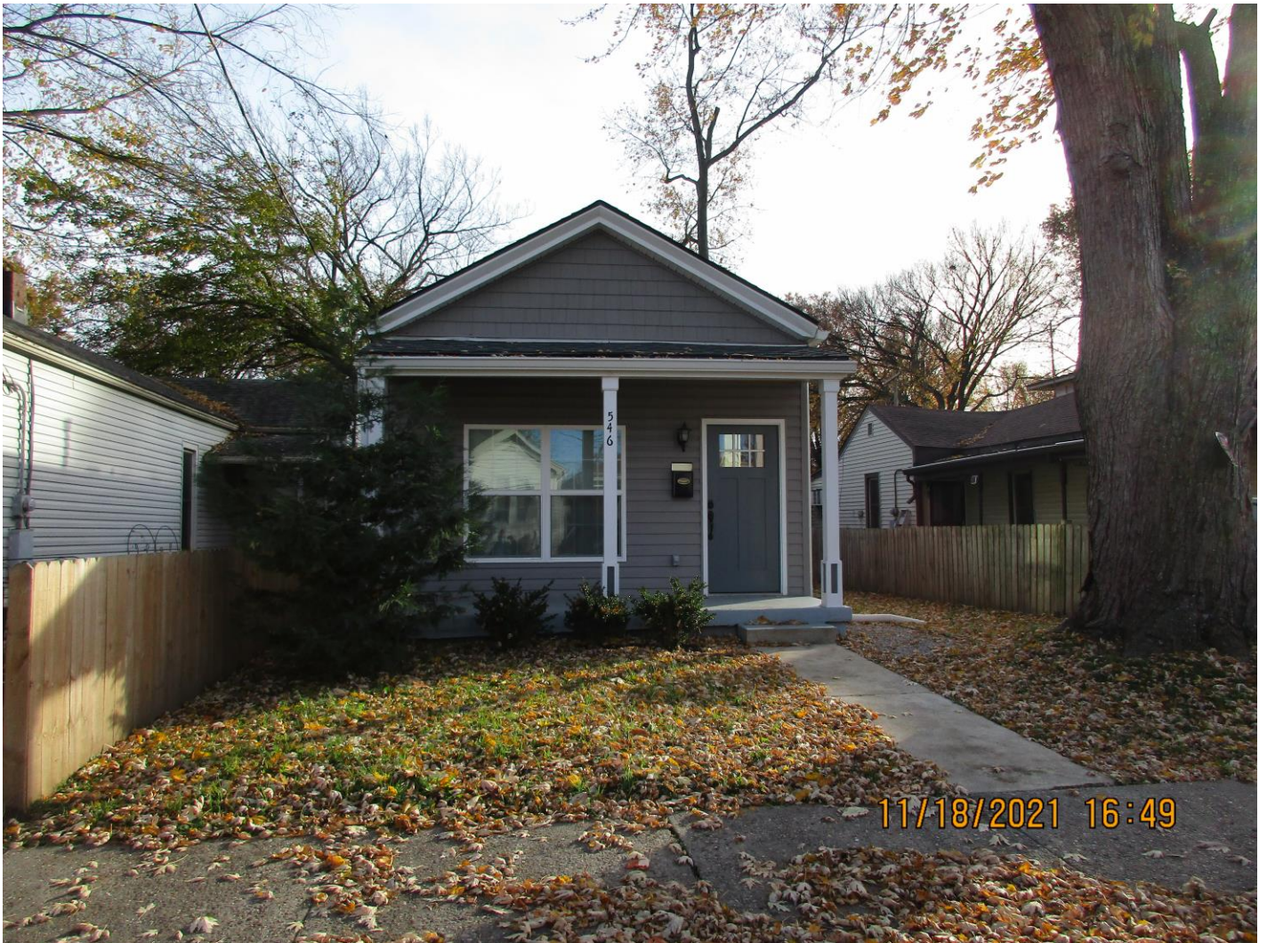
Front of subject property.