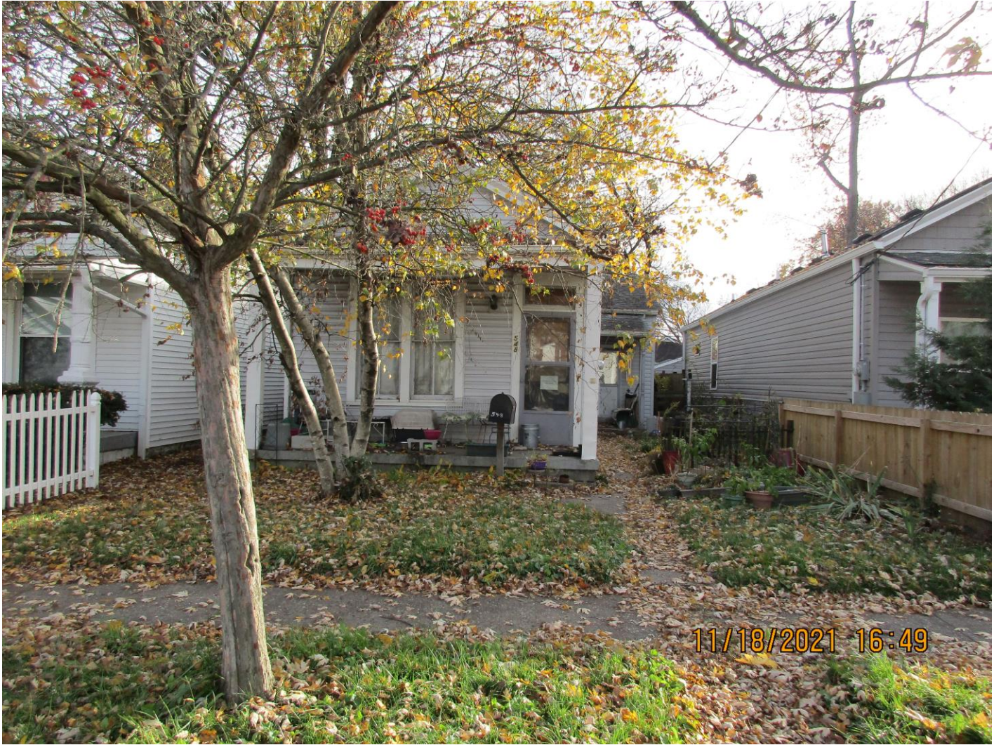
Property to the left.