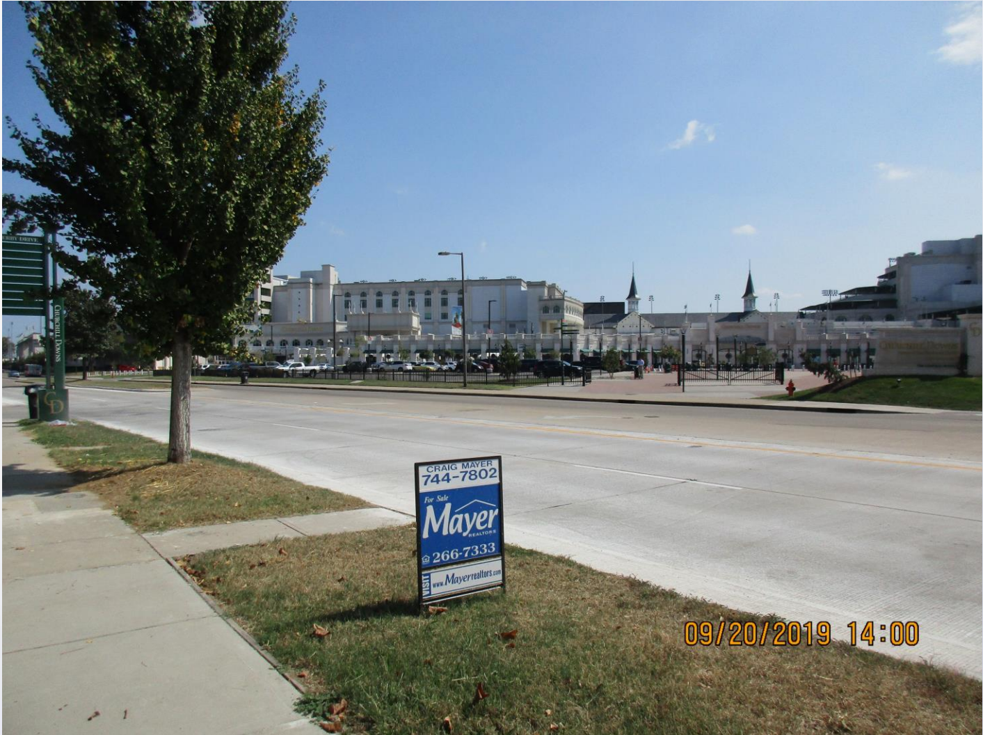
Across to South