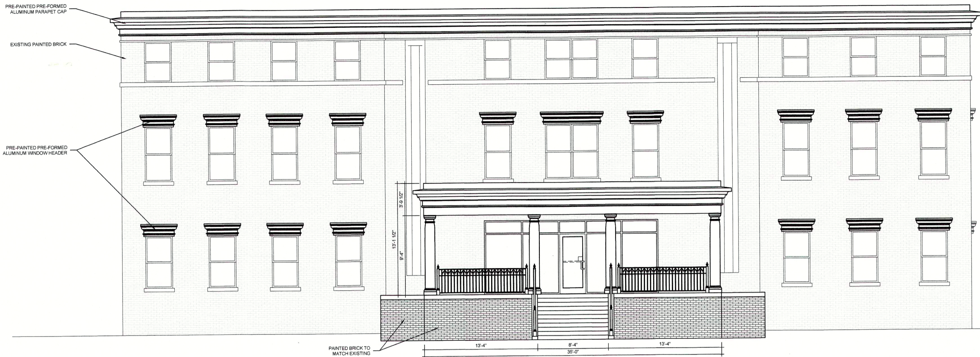
01 PROPOSED 3RD ST. ELEVATIONS SCALE: 1/4" = 1'-0"