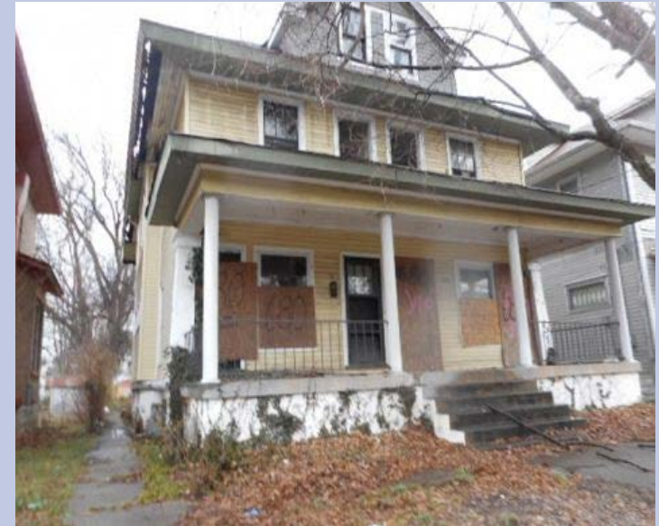
38 th St. at acquisition