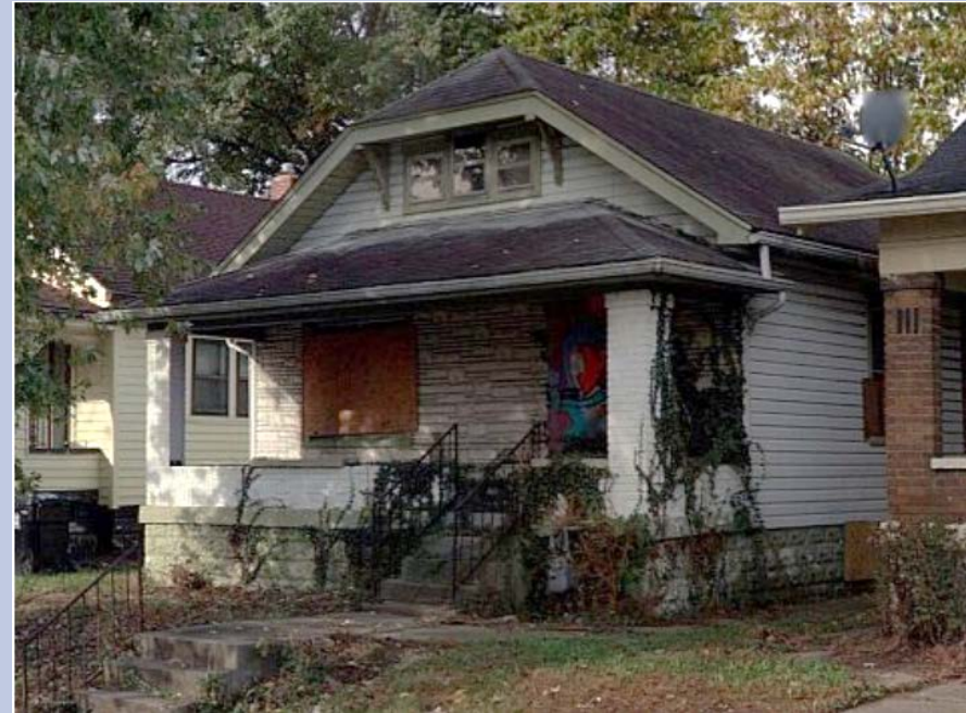
My Louisville Home Pilot Project – Parkland House