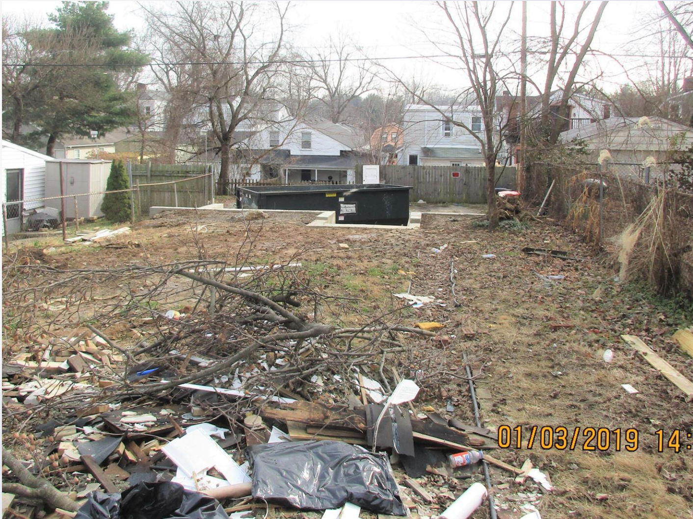
Rear From Residence