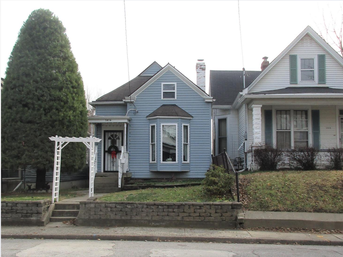
Adjacent to East