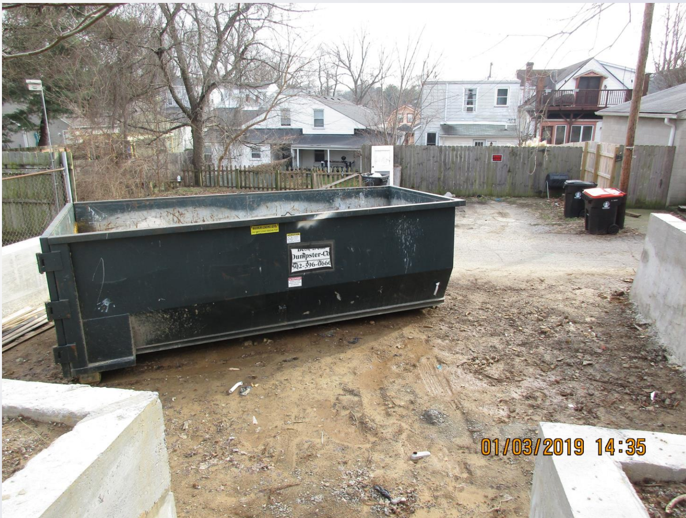
Rear Parking Area