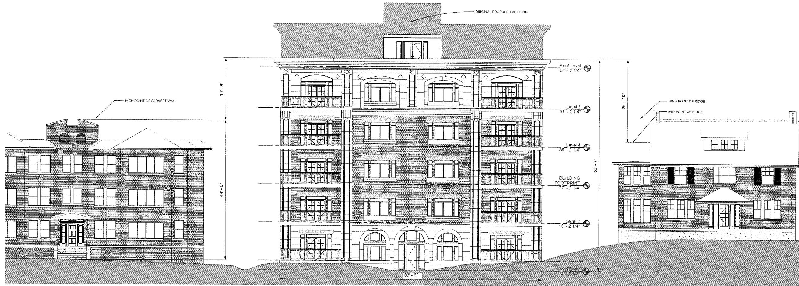
1 FRONT ELEVATION A201 1/8" = 1'-0"

C:\Users\helton\AppData\Local\Temp\A201.dwg, 2/1/2019 10:25:33 AM, Helton, 1:2.19439