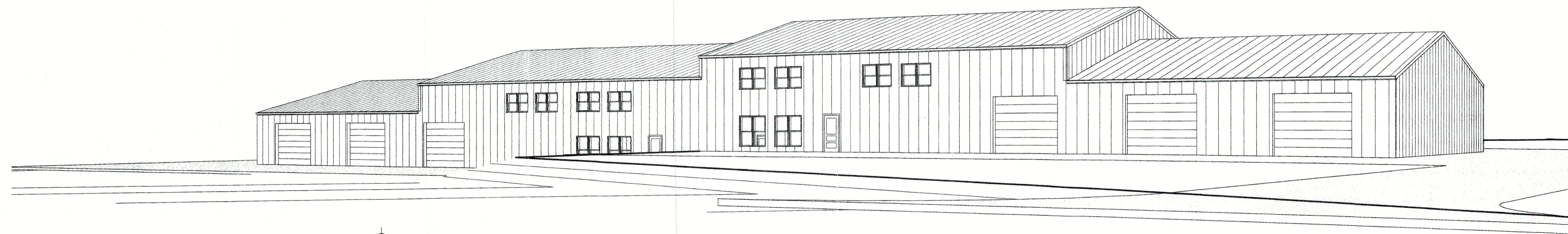
2 STREET PERSPECTIVE