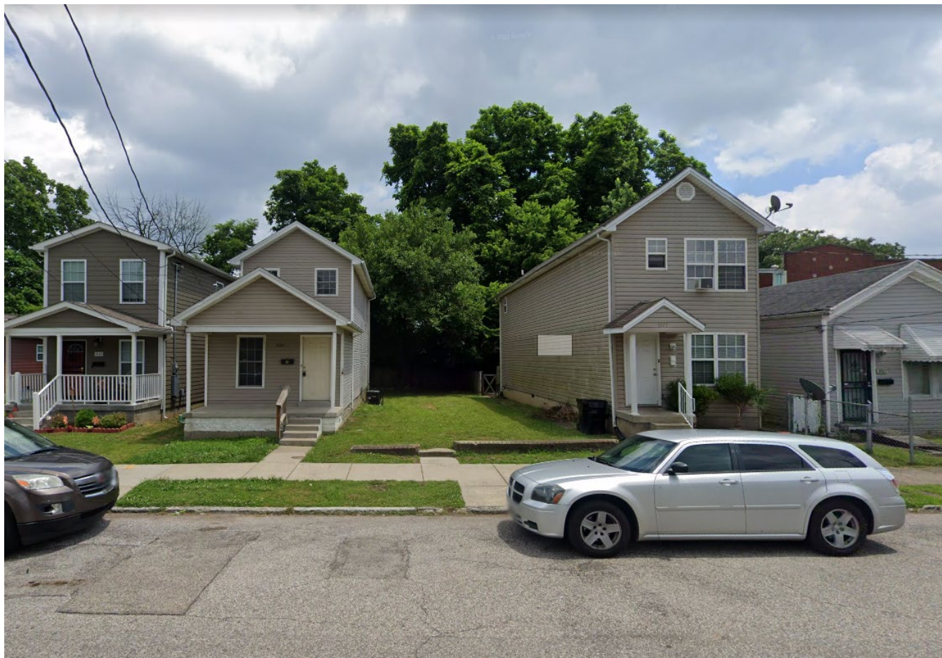
Front of subject property and adjoining properties, Google 2019.