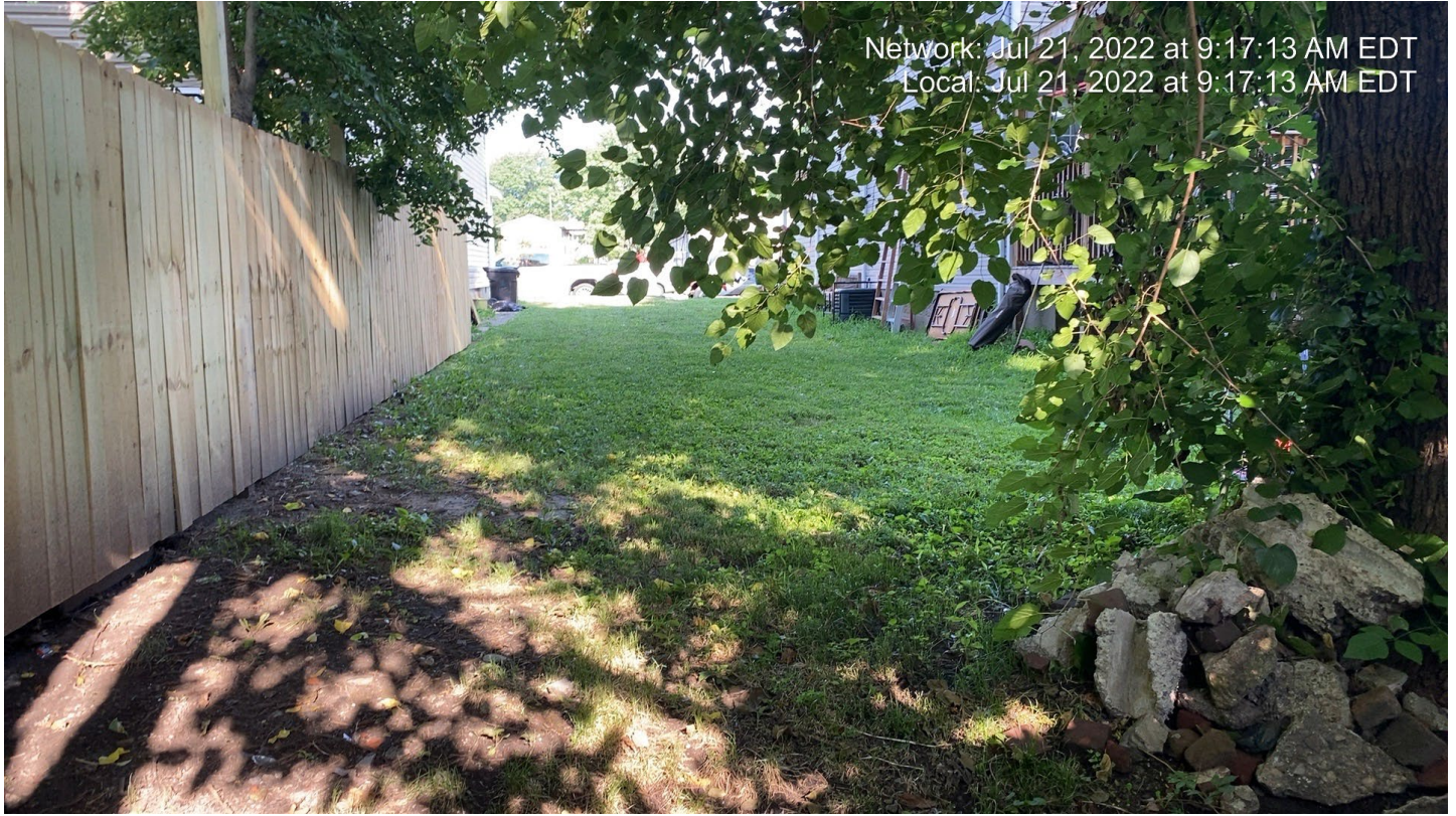
View of variance area from rear yard.