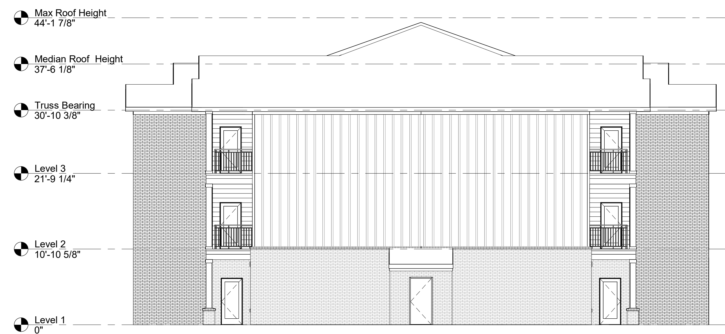
3 Elevation - Type B - Left A202 1/8" = 1'-0"