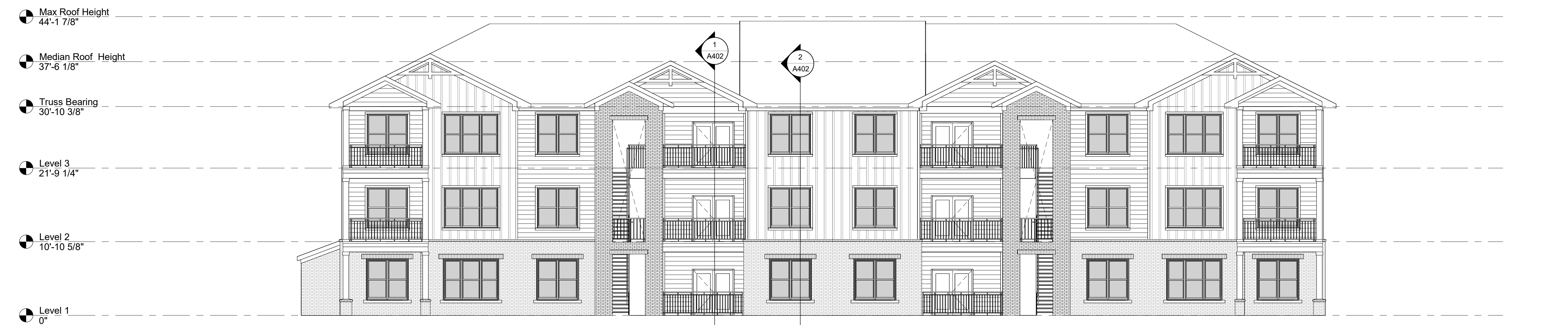
1 Elevation - Type B - Front A202 1/8" = 1'-0"