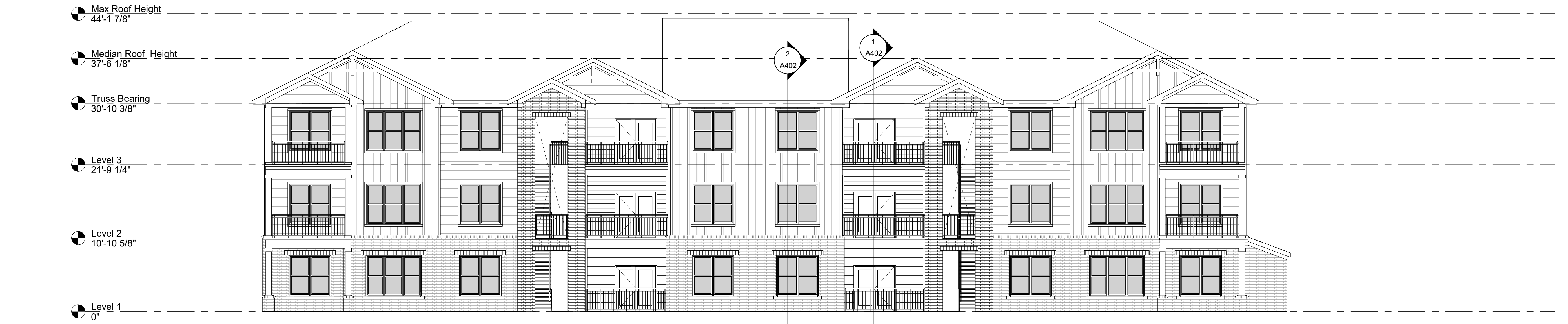
2 Elevation - Type B - Rear A202 1/8" = 1'-0"