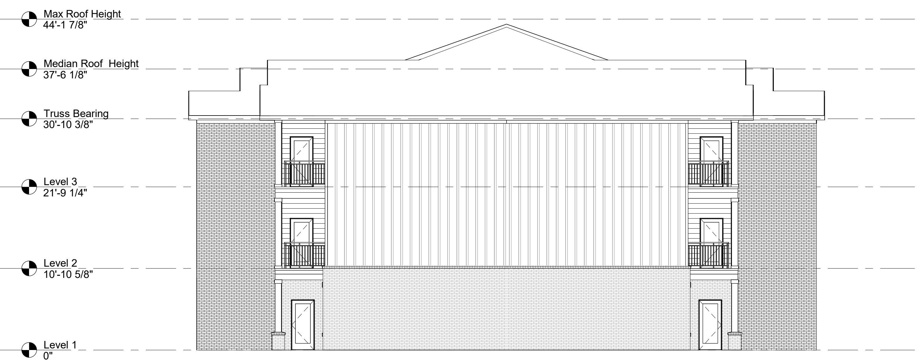
4 Elevation - Type B - Right A202 1/8" = 1'-0"