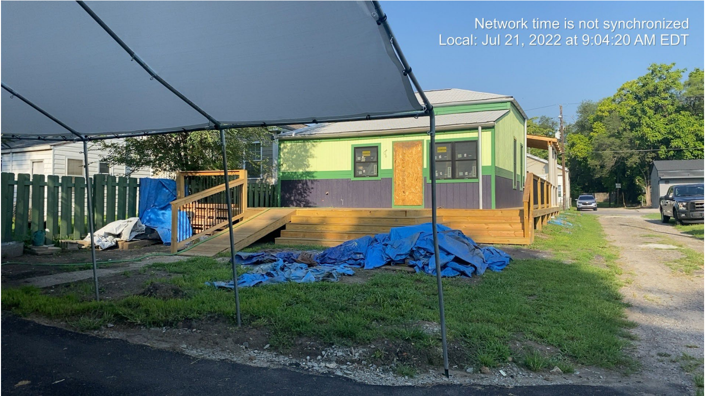
Rear deck and private yard area

Network time is not synchronized Local: Jul 21, 2022 at 9:04:20 AM EDT