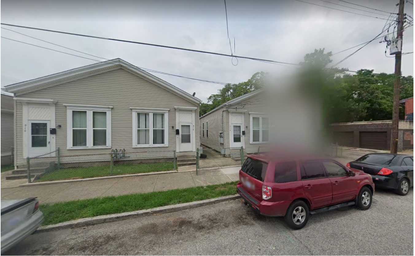
Properties across S. Hancock Street.