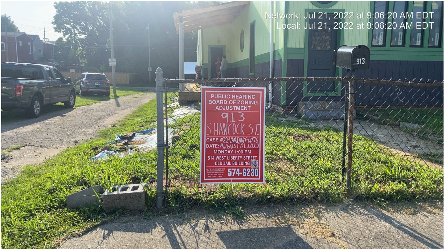
Front of subject property.