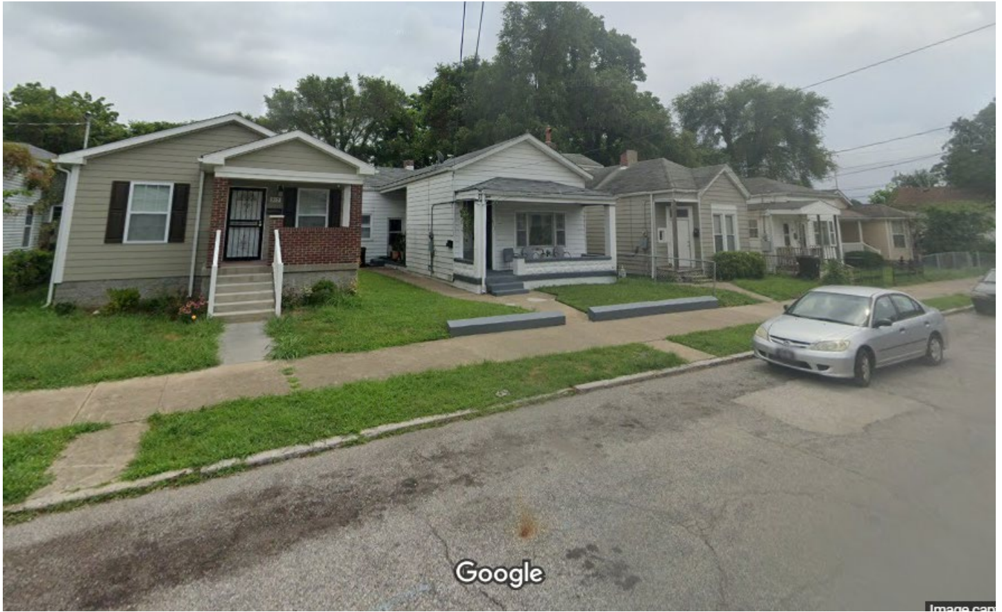
Properties to the right, Google 2019.