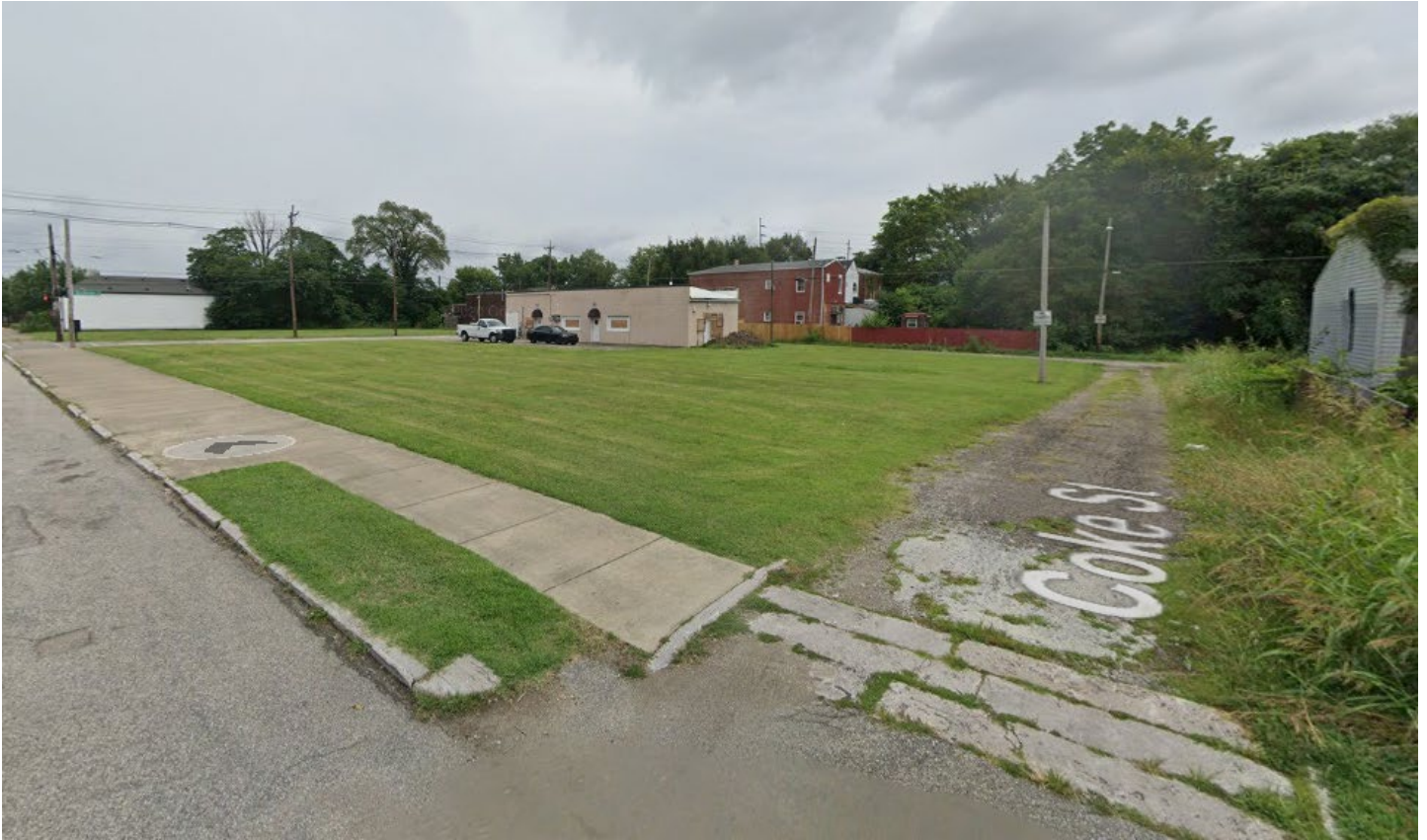
Property to the left across Coke St. Google 2019.