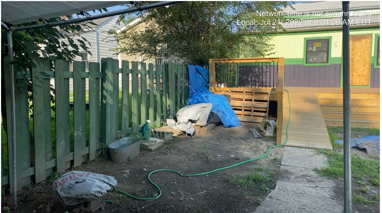
Side yard variance area.