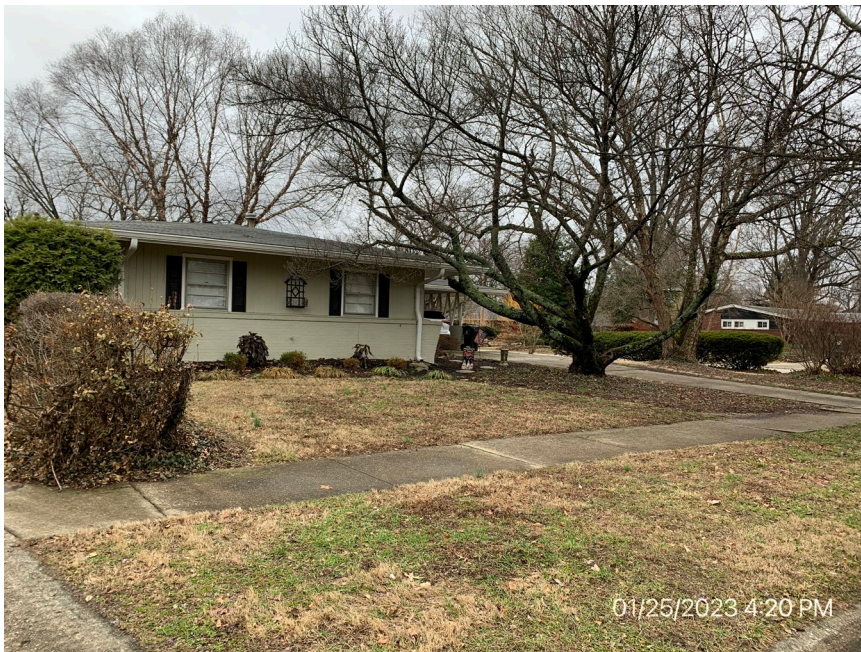
Adjacent Property to the Right