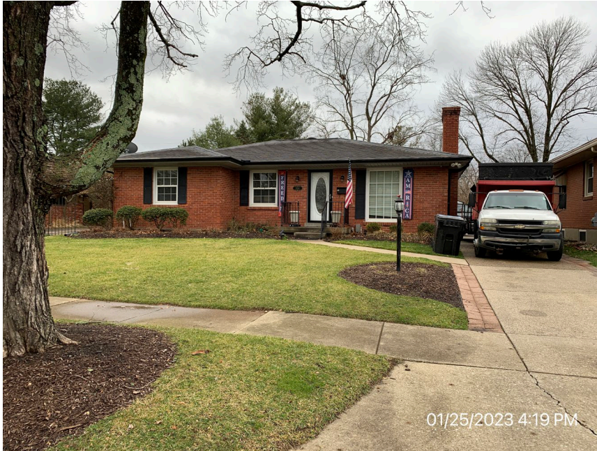
Adjacent Property to the Left