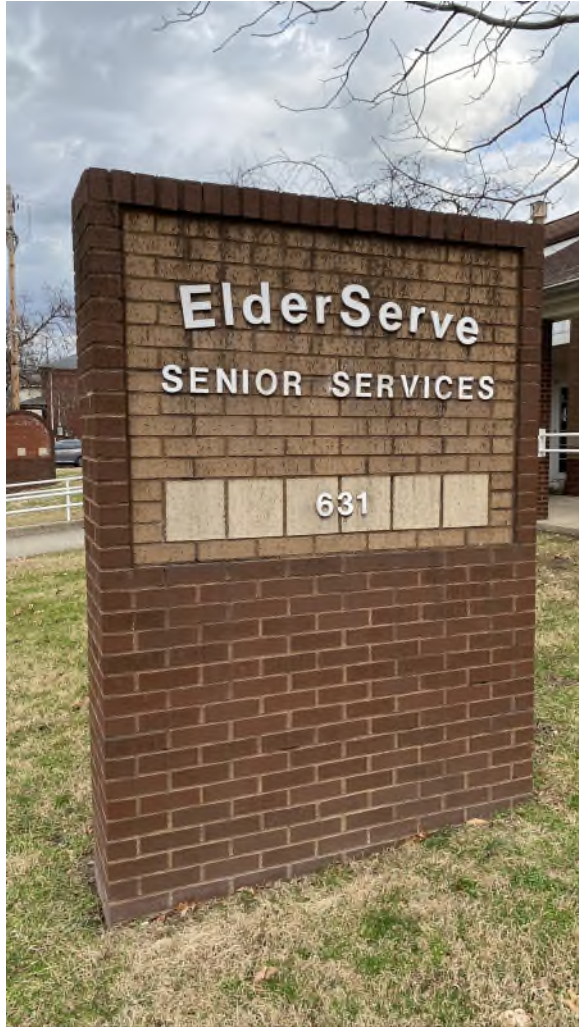
Existing Sign 1