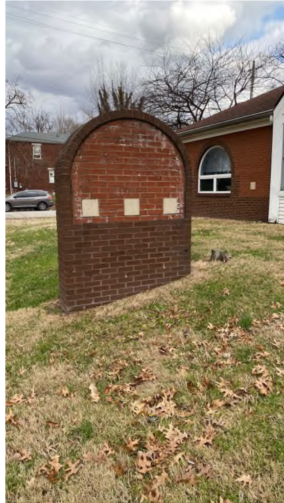
Existing Sign 2