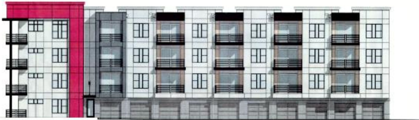
BUILDING 2 EAST ELEVATION