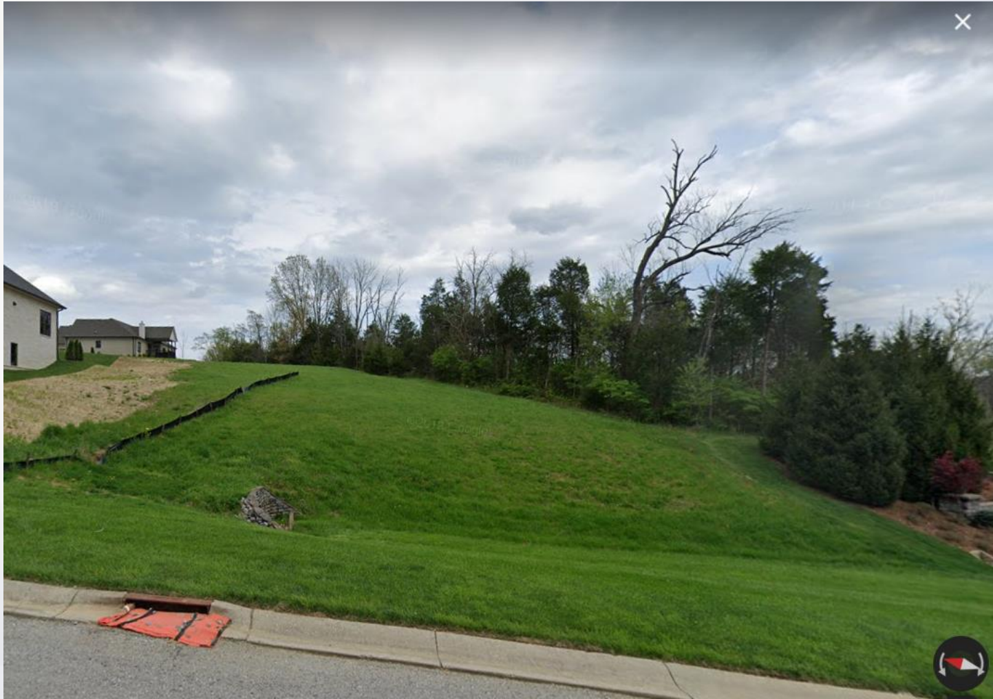
Front View of Site