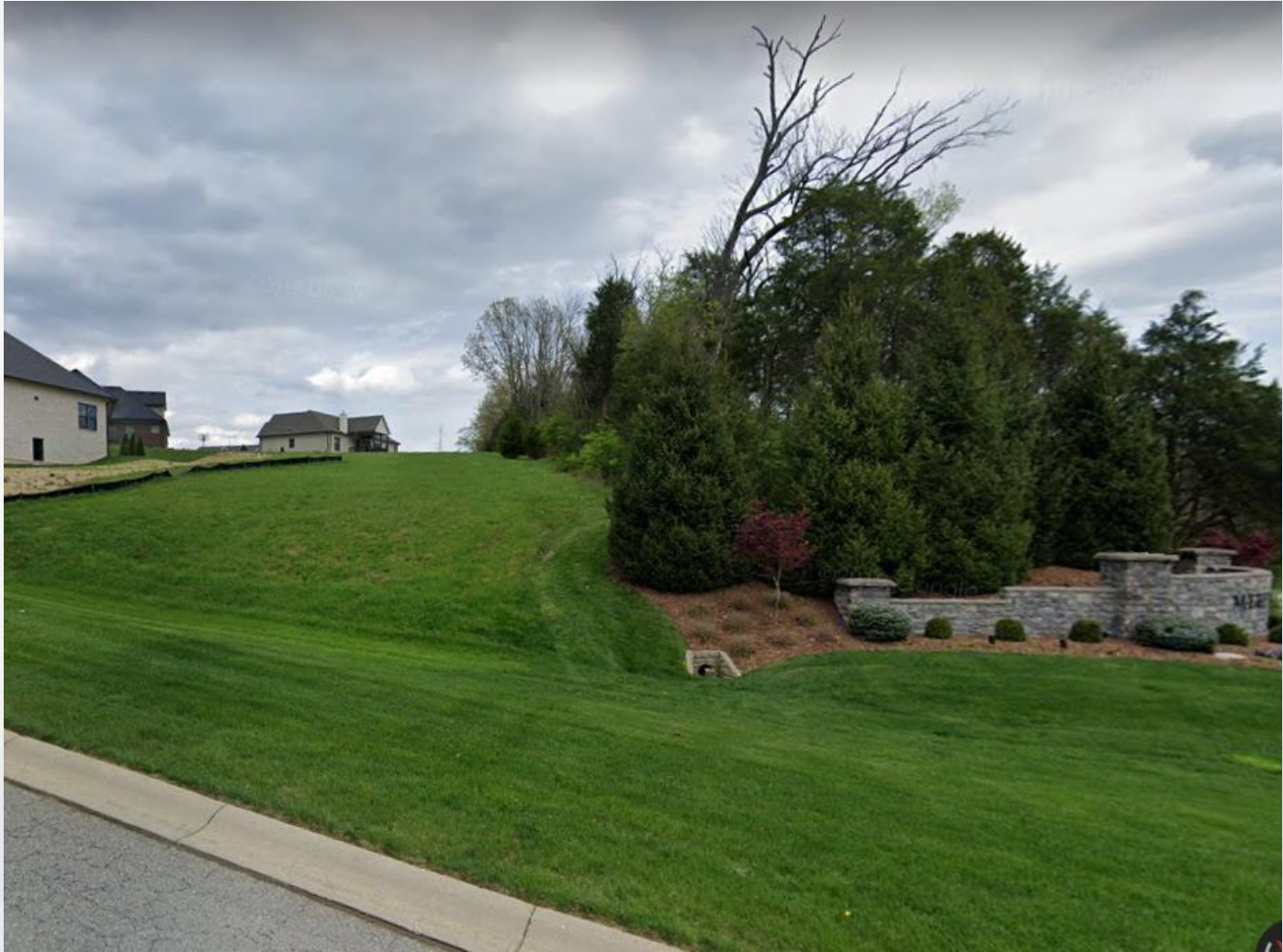
Corner View of Site