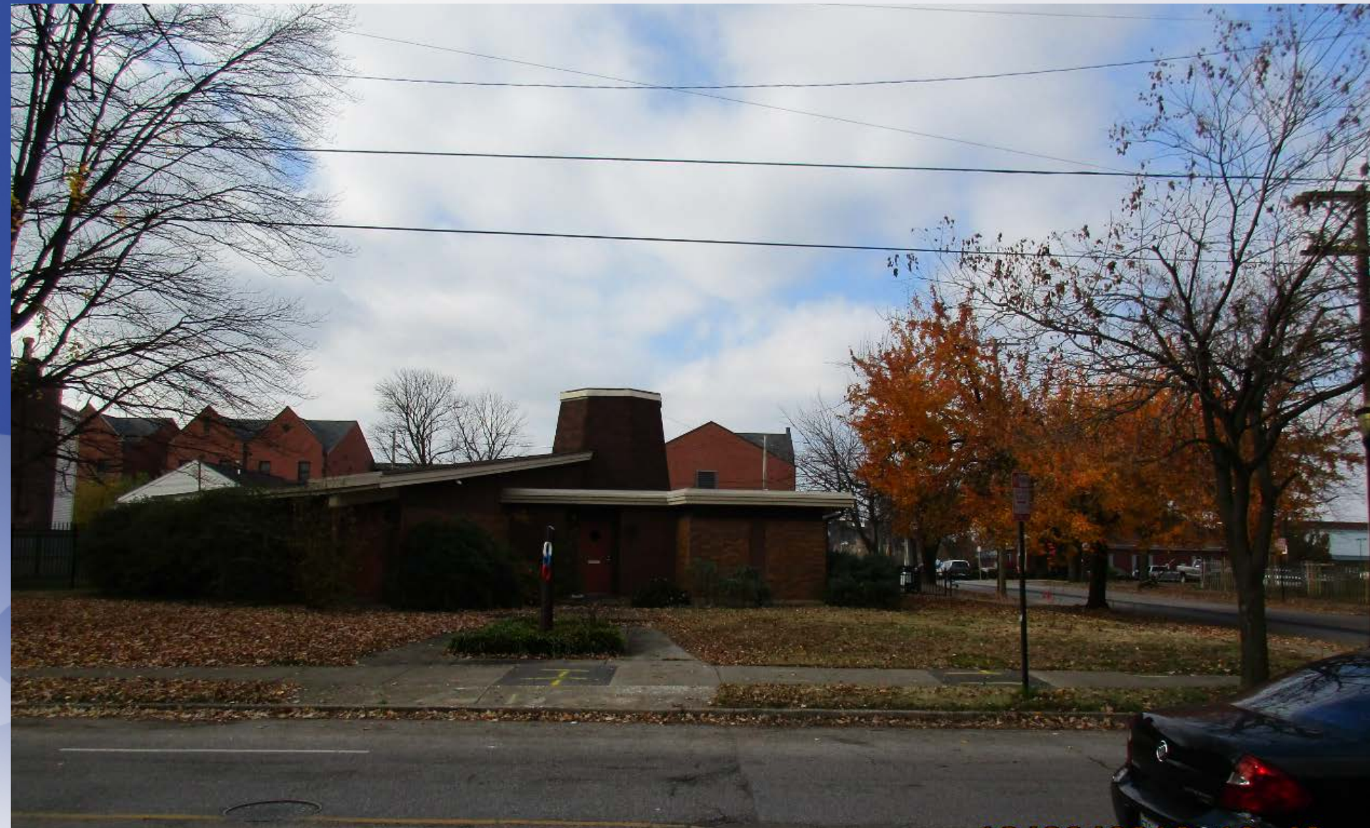
Across Street , Looking West