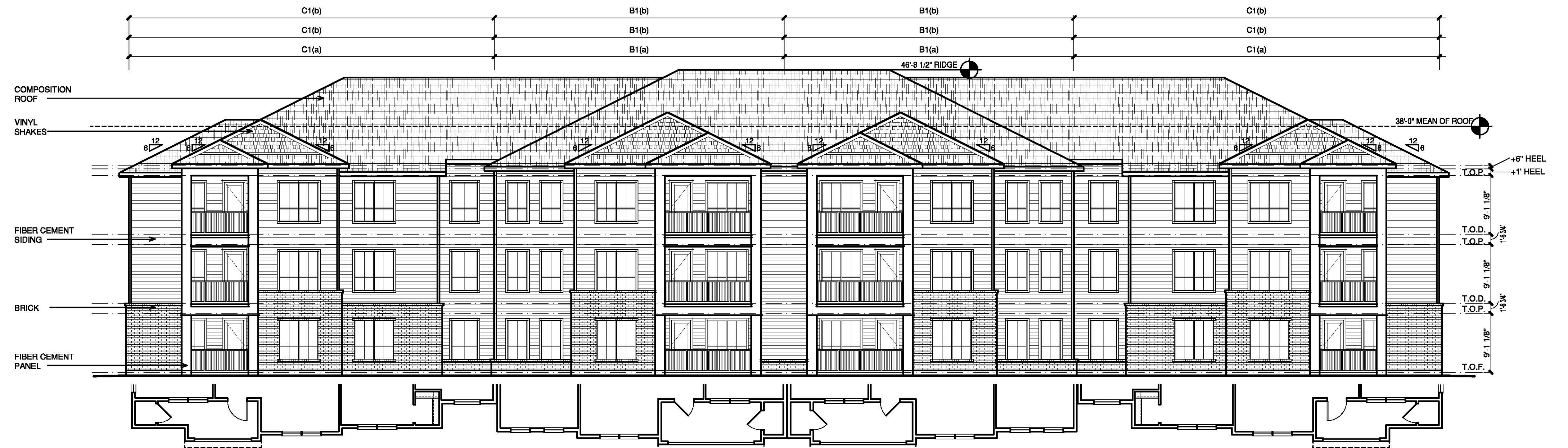
2 BUILDING "B" REAR ELEVATION SCALE 3/32"=1'-0"