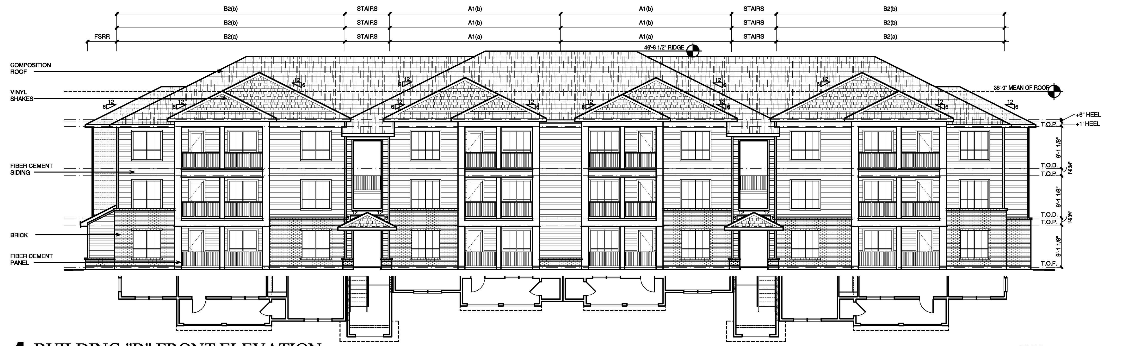
1 BUILDING "B" FRONT ELEVATION SCALE 3/32"=1'-0"